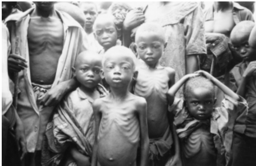
The brutal cost of the Anglo-American-backed invasion of Zaire by Rwanda and Uganda: starving refugees in a camp south of Kisangani in Spring 1997.