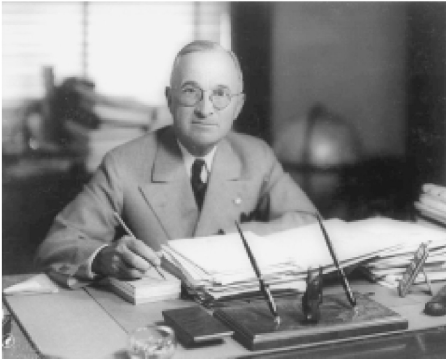
The policy of perpetual war pushed by Dick Cheney's faction found its representative after World War II in Harry S Truman. "Truman was the realization of this. Truman was, in effect, a Nazi! The President of the United States, a Democrat! And Truman and the British launched the so-called Cold War policy."

other, then you can have peace. And that's the only way you get peace in this kind of warfare, religious warfare.