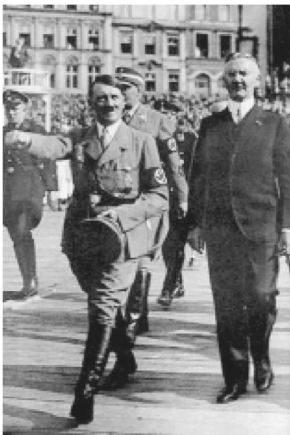
Hjalmar Schacht (right), Reichsbank chairman and Hitler's Economics Minister, led those who moved Nazi assets, leading operatives, and networks into alliance with Anglo-American finance after the war.