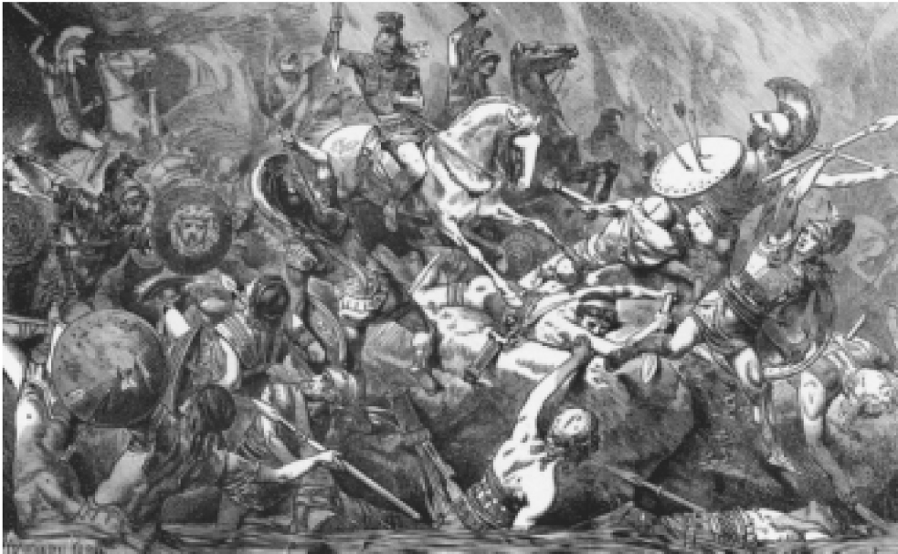
The Athenian army in Sicily in 419 B.C. during the disastrous Peloponnesian War. “The planet as a whole would degenerate, in a way comparable to the way that the Greek civilization underwent a partial degeneration into a relative dark age, as a result of the Peloponnesian War.”

existence of civilization depends upon acting, to get rid of what Cheney represents, and to find a peace in the Middle East (or, so-called Middle East), which is being used as a cockpit to destabilize the world.