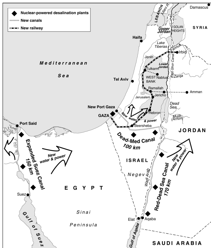
The most crucial economic issues of the Middle East require water and power development, as a basis for a solution to the Israel-Palestinian conflict. Here we show LaRouche's Oasis Plan for the area, issued in the late 1980s.

and stable relations with areas outside the region, are the first line of defense of the region from the forces and other perils which presently menace it. The crucial role of transport development is a leading example of the measures of defense required.