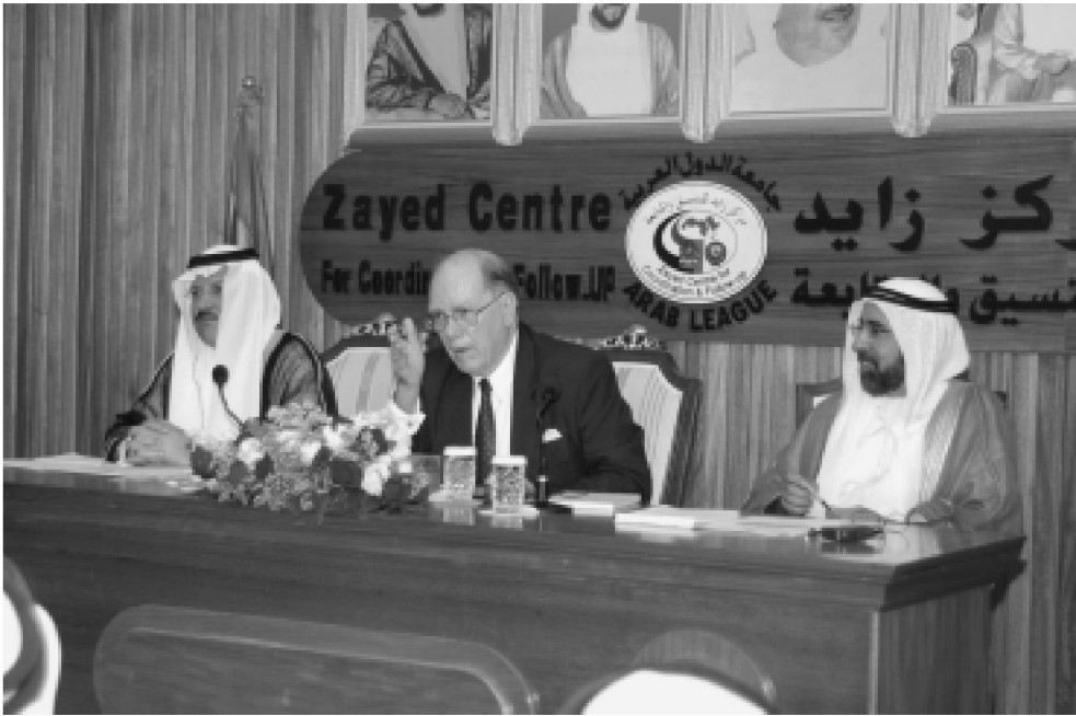
Lyndon LaRouche speaking June 1 to the Zayed Centre for Coordination and Follow-Up in Abu Dhabi, at the opening of the Centre's two-day conference. On LaRouche's right is U.A.E. Oil Minister Obeid Bin Saif Al-Nasseri, and on his left, former Iraqi Oil Minister Essam Abdul-Aziz Al-Galabi.

live, there is no peace; they will live as the successive waves of "land pirates," including the Mongol empire, swept into Europe, and the Middle East, from across Eurasia, in times past. There will be no peace without adequate provision of water.