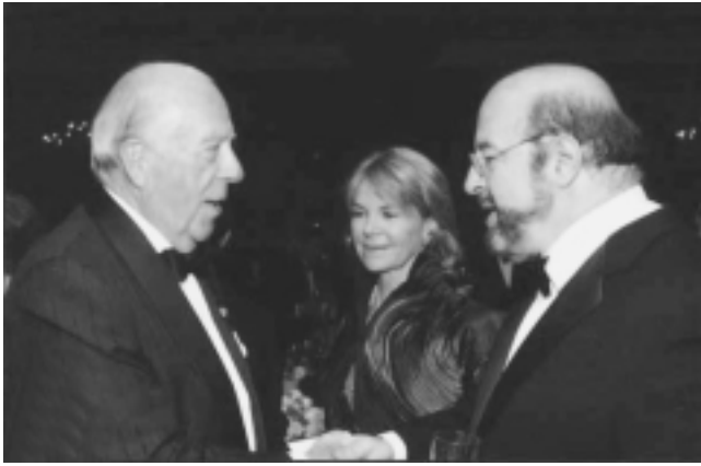
The patron of Cato is also the “godfather” of Social Security privatization, in Chile and the United States: senior Republican fixer George Shultz of Bechtel (left). He chatted with Hernando de Soto (right) at Cato’s gala to present the 2004 Milton Friedman Prize for Advancing Liberty, to de Soto.

Aristotelian philosopher Karl Popper; and the slavishly pro-British American “liberal” journalist Walter Lippmann. Most of the 36 were fanatical ideologues. But representatives of the higher layers of the wealthy oligarchical families, for whom these ideologues served as “Leporellos,” were there, including Sir John Clapham, long time official, and official historian of the Bank of England, who had served as President of Britain’s oligarchical power center, the Royal Society. Not present at the first meeting, but asserting themselves at subsequent meetings were Otto von Hapsburg, pretender to the throne of the Hapsburg empire, and Max von Thurn, of the immensely wealthy, Bavarian-based Thurn und Taxis family. Bankers of the City of London and Wall Street would soon appear.