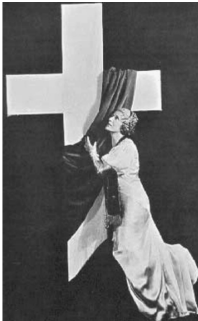
Aimee Temple McPherson, a religious fundamentalist of the Roaring Twenties, saved souls by seductively wrapping herself around a cross.

While crowds at these revivals swelled, the corporate sponsors, which included names such as Morgan, Rockefeller, Weyerhaeuser, Swift, Armour, and Marshall Fields, could barely contain their glee, as the religious snake oil went down with big gulps of preaching about the God-given necessity for laissez-faire/free trade economics, compliant workers, and