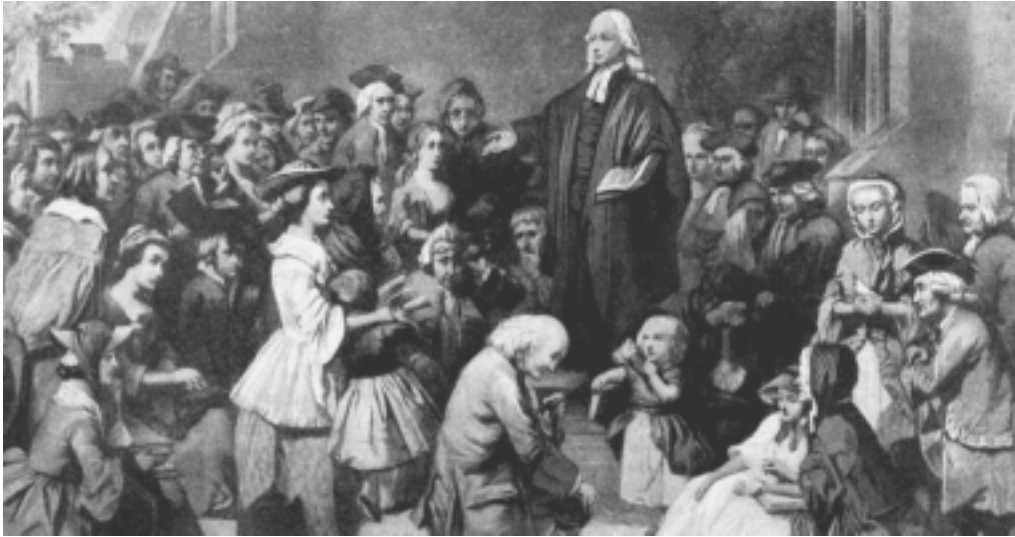
John Wesley (1703-91) founded the Oxford Methodists movement in England. His revivalist tradition was transplanted to America in the 1740s, starting in Kentucky.

on by the Mathers to Franklin. It was thus Leibniz's "life, liberty, and the pursuit of happiness" which were established as the inalienable rights defended by the Founding Fathers in the 1776 Declaration of Independence, and not the degenerate Locke's "life, liberty, and property."