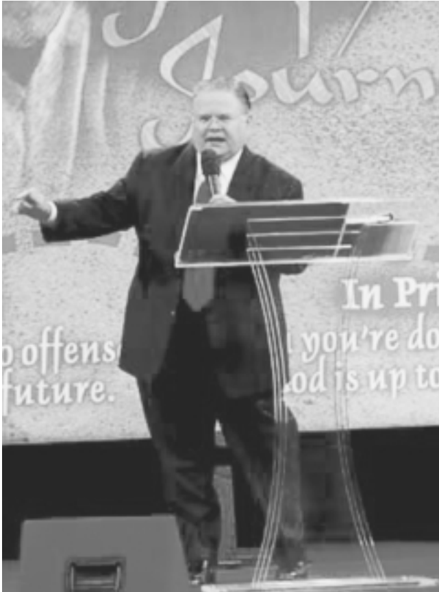
Rev. John Hagee, author of books on the impending Battle of Armageddon, says there is nothing to worry about except personal salvation, since the End Times are near.

panied him were not merely fleeing religious persecution; they were creating a flank in the New World, to demonstrate the superiority of a republic to the monarchical regimes of Europe, which were allied with dominant and often-corrupt churches. This is the meaning of Winthrop's challenge to his fellow migrants, that "we must consider that we shall be as a city upon a hill. The eyes of all people are upon us." 9