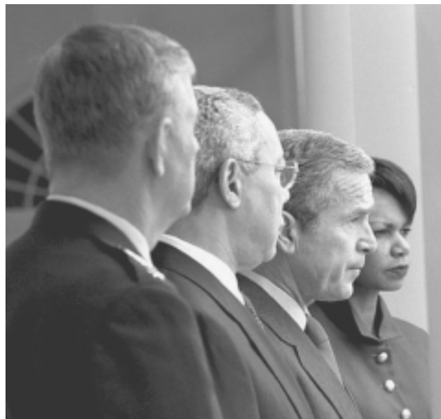
The President's "group" protects him from the outside world. Here, Bush is flanked by top officials of his first Administration (left to right): Chairman of the Joint Chiefs of Staffs Richard B Meyers, Secretary of State Colin Powell, Bush, National Security Advisor Condoleezza Rice.

EIR: Over the course of the term as President, would you characterize his psychological state as having deteriorated? Is it an accelerating deterioration? Because, it is an important preview of what kinds of things we may be in store for in the next couple of years.