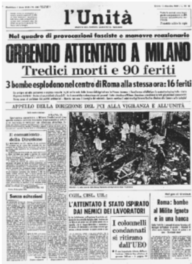
The Italian Communist Party's newspaper reports the Piazza Fontana massacre of 1969, the opening shot of the Gladio-run "Strategy of Tension."

that would be utilized in the coup attempt, and through probable CIA operative Hugh Fenwich, who was meeting with Orlandini.