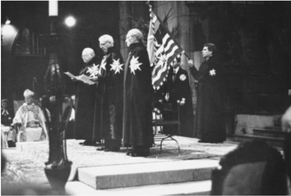
Investiture of the Knights of Malta at the Cathedral of St. John the Divine in New York City in 1982.

quarters at 68 Via Condotti in Rome. They maintain their own fleet of aircraft, have diplomatic relations with 92 nations as well as the United Nations and the Holy See, and enjoy diplomatic immunity. The order is entirely Roman Catholic, and its higher ranks must document an aristocratic lineage and coat-of-arms of at least three centuries. The Grand Master of the order is both a secular prince, and a cardinal of the Church. Reflecting its history, its membership is still heavily comprised of individuals with a military or intelligence background. Pope Pius XII ordered an investigation of this nominally Catholic organization in the 1950s. The Papal Commission charged, among other things, that the Order should not have the sovereignty of a state, and ordered modifications of the SMOM “to bring them into conformity with decisions of the Holy See.” However, Pius XII died before the Order could be fully reined in.