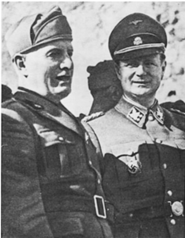
Benito Mussolini (left) with SS Gen. Karl Wolff. Under orders from Wolff, Borghese and his X MAS forces waged brutal warfare against the anti-fascist partisans. After the war, Wolff and Allen Dulles secured Borghese's release from Allied custody.

Rome's black aristocracy asked the Allied military governor in Italy, Vice Adm. Ellery Stone, to intervene in favor of the "terrible boy," Junio Valerio. A friend of the Borghese family and lover of a Roman baroness, Stone needed little convincing. As the partisans closed in on Borghese in May 1945, Stone instructed Angleton to warn him, which the latter did personally. On May 19, the Americans formally arrested Borghese, thus saving him from scheduled execution by a partisan firing squad.