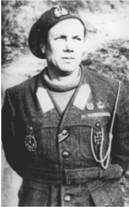
Junio Valerio Borghese, the "Black Prince," wears his Gold Medal, Military Order of Savoy, and Germany's Iron Cross, during the war. He and his men were implicated in every major postwar coup attempt and terrorist incident in Italy, until he fled to Spain in 1970.

claim descent from the elite of the Roman Empire. Numerous Popes and cardinals came from the Borghese and allied families, such as the Pallavicini, the Colonna, and the Orsini; these families maintained enormous power into the 20th Century, and still today, in the Curia, the administration of the Vatican. Their faction within the Church helped construct the infamous "rat-line"—run, in part, through monasteries and convents—which spirited thousands of Fascists and Nazis out of Europe after the war, into Ibero-America, Asia, and the Middle East.