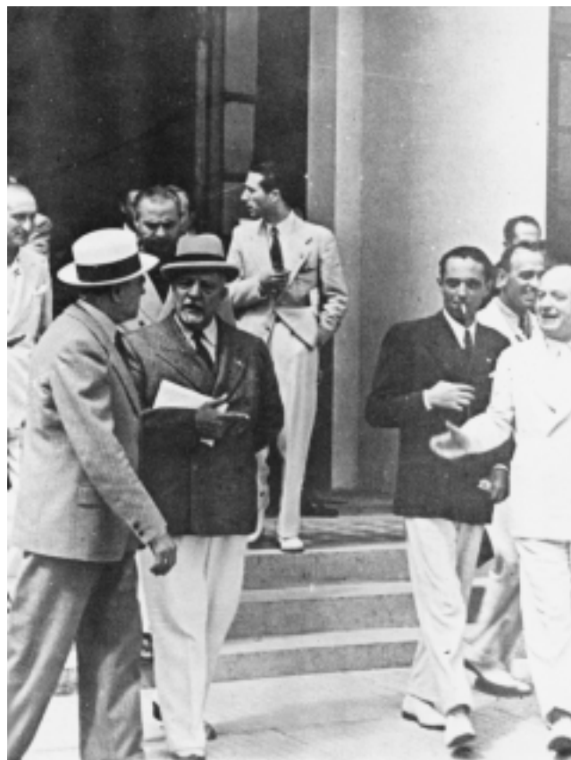
Count Giuseppe Volpi di Misurata (second from left) organized Mussolini’s rise to power, on behalf of the synarchist financial syndicate that included the Bank of England, the Mellons, and the Morgans.