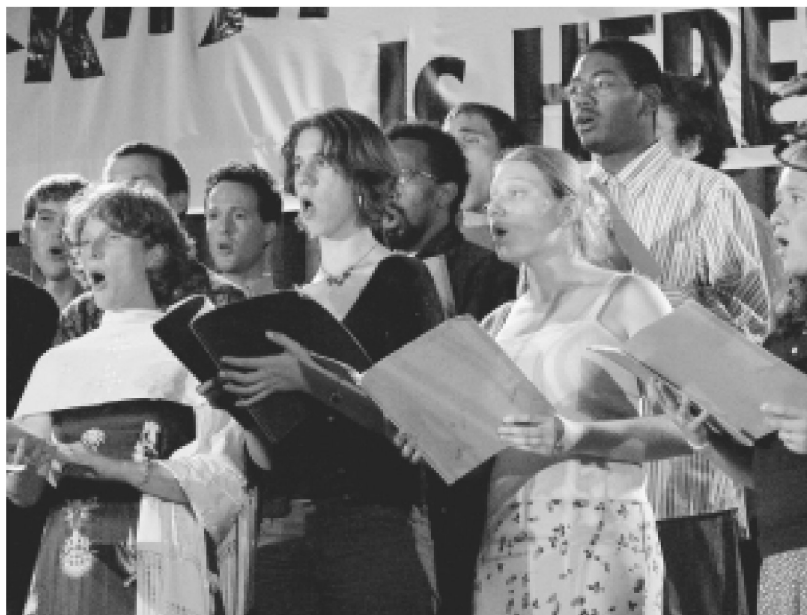
The LaRouche Youth Movement chorus sings Bach's motet "Jesu, meine Freude." LaRouche chose this advanced choral work, along with Gauss's Fundamental Theorem of Algebra, as the foundations of intellectual work for his youth movement.

So, what we need to do, is start from the top down, not from political authority, and scientists begging at the doors of political authority. We have to have movements, which are based upon movements of ideas among people. Especially young generations, upcoming. As they come into about the age of 18, where they pass over from adolescence to young adulthood, is the time of the richest development of the future