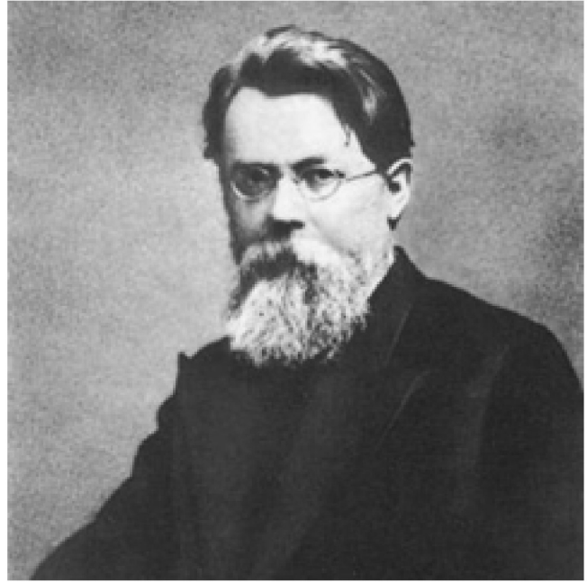
Vladimir Vernadsky's conception of the Noösphere is "the greatest revolution in policy which has been introduced to this planet, in terms of conception of social policy."

So, the problem is now, there are raw materials in Asia, tremendous amount of primary mineral resources in Asia,