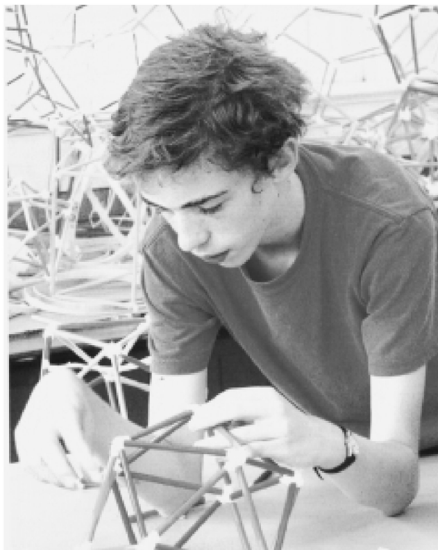
Study of constructive geometry at a Schiller Institute camp, 2004. LaRouche recognized in adolescence that he "could never accept the idea of a geometry, or physics, premised upon allegedly self-evident definitions, axioms, and postulates of a so-called Euclidean or kindred doctrine in geometry."

that it moves; Kepler asked, and discovered that which moves it. 4