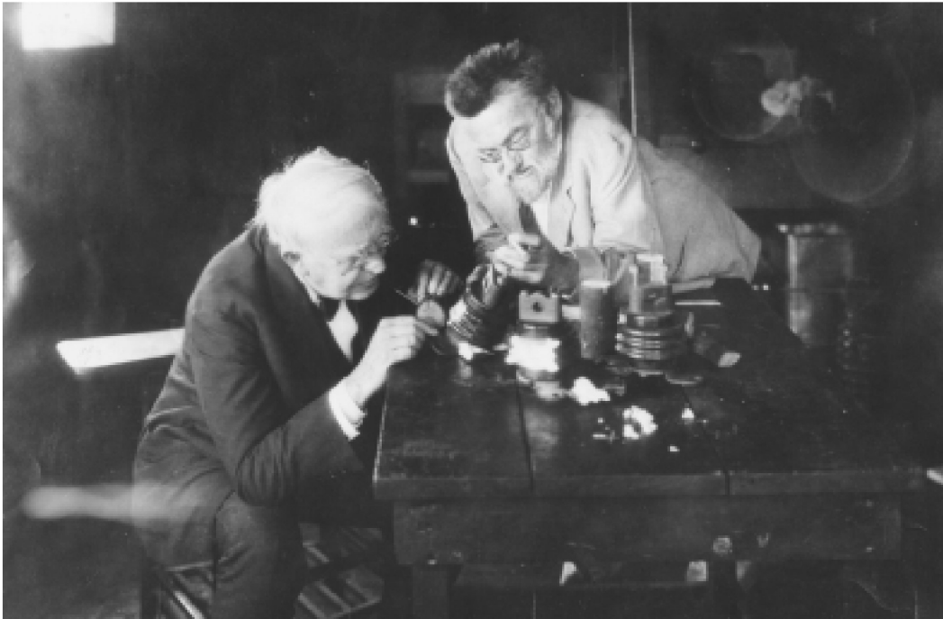
Scientist Thomas Edison (left) with engineer Charles Steinmetz, in 1922. The divorce of the "science" of economics from the reality of physical productive processes, has led to the current catastrophic breakdown crisis.

political-economy which defined a durably successful design of modern economy, beginning more than two hundred years ago.