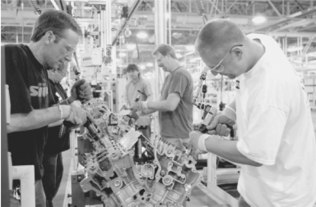
The destruction of the U.S. auto industry, such as General Motors, provides incontestable proof that U.S. businessmen and financiers have not mastered the principles that are required for an economy to prosper.