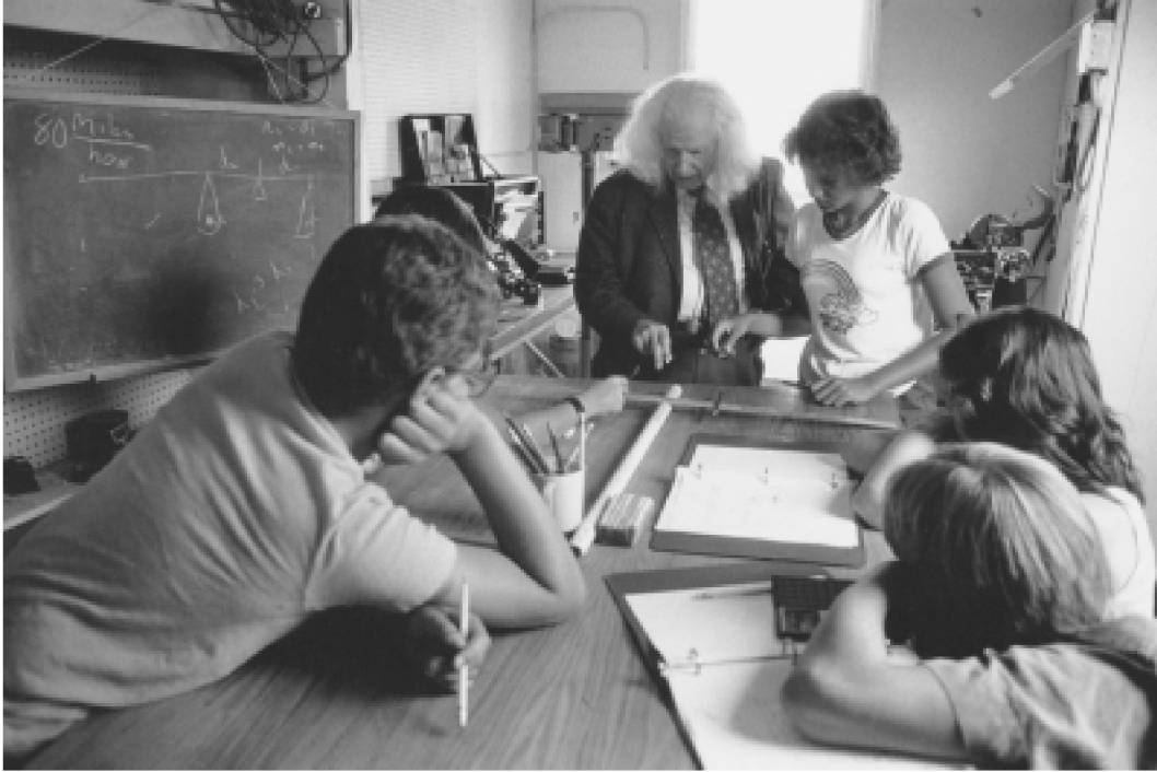
The late physicist Dr. Robert Moon, a friend and collaborator of LaRouche, working with young people, at a Schiller Institute camp in 1986, to replicate Ampère's experiments in electromagnetism.

ing usable knowledge of the principle of fire to mankind. 15 It is the denial of the right of human beings generally to have access to knowledge of those universal physical principles typified by Prometheus Bound 's notion of the power of fire, which is typical of the way the oligarchical principle of usury operates as the enemy within a modern commonwealth such as the U.S.A. today.