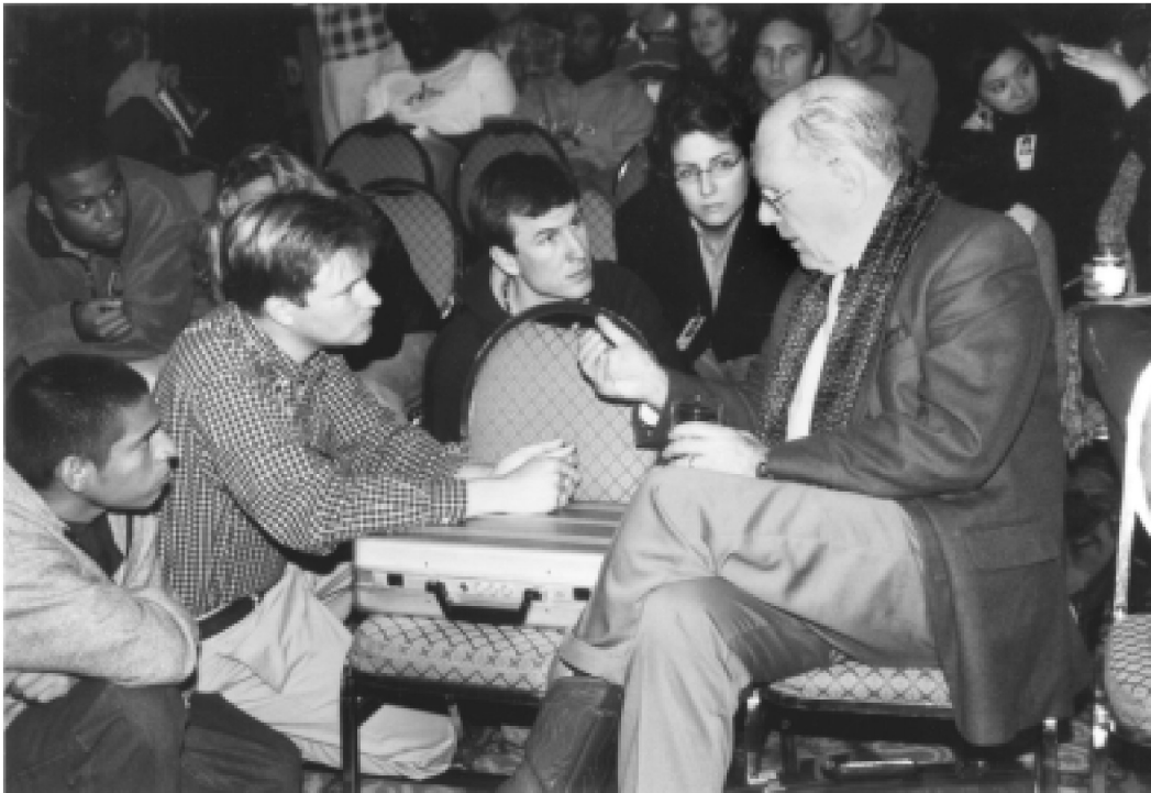
LaRouche with organizers from his youth movement. He challenges them to master the principles of the complex domain, as elaborated by Gauss, Riemann, and others, in order to understand “the way competent modern physical science represents both the difference and connection between the real universe and the shadow-world of sense-perception.”

from a presently onrushing disaster, which touches the heart of a scientific quality of professional practice of physical economy. As an illustration of the latter point, take a key feature of my just-issued report on the prospects of a recovery, which I have just issued as a motion presented to the members of the U.S. Senate. This present report is crafted as a technical supplement to that report.