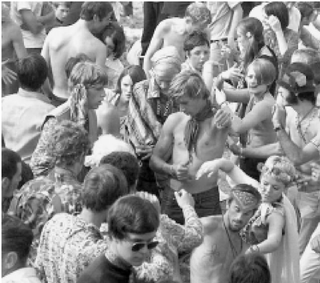
BoBos at Woodstock, 1969. "There was nothing accidental, or spontaneous," LaRouche writes, "in the special characteristics which the BoBo generation's pace-setters adopted in their determination to destroy the culture which their parents and grandparents represented."

this time, the BoBos and their presently adult offspring, which must be the center of our attention, in exposing the systemic features of the conflict between the generation of today's young adults' and their parents' acquired habits. For both of those relatively younger generations, we of my generation (65-90+ years) have the advantage of seeing the larger reality to which the BoBo generation is blinded by its own ideological self-adulation, and we also have the advantage of being able to show the present, new generation of young adults a hopeful reality, which the ideology of the BoBos wishes to mislead the young, such as today's neo-conservative aberrants, into ignoring.