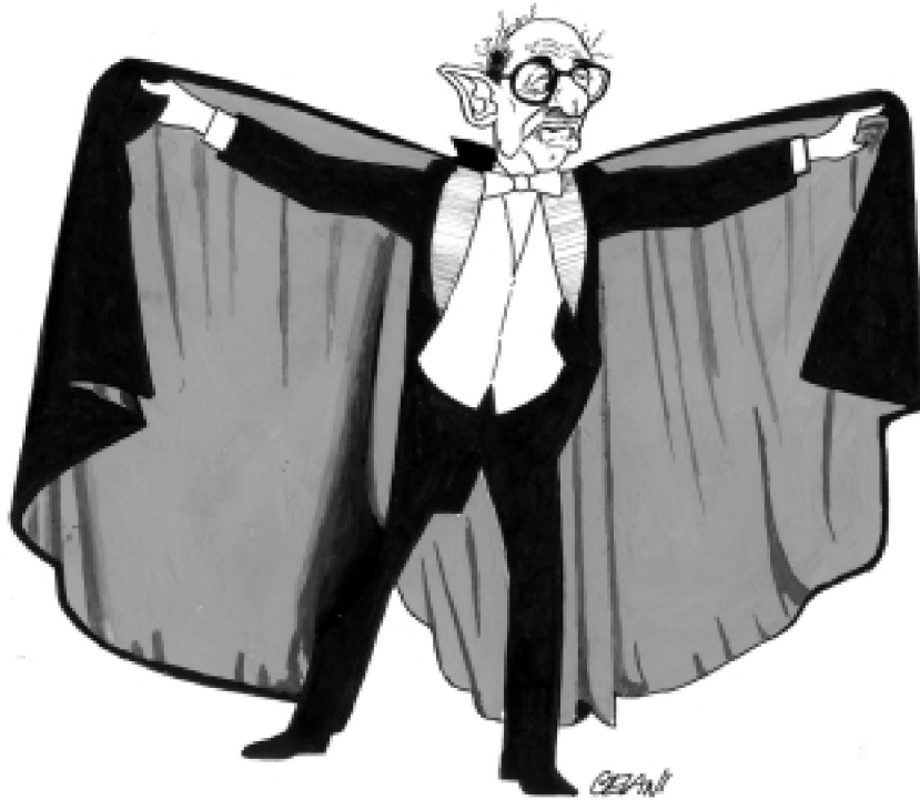
Alan Greenspan "traded off a mere Hoover-style collapse, for the glory of a crisis which would blow the financial world virtually out of existence."

The October 1987 stock-market crash was an event comparable to the 1929 Hoover crash. Within Andrew Mellon's system of that day, strict financial conservatism of those times meant a collapse of the real economy of the U.S.A. by approximately one-half, which the Hoover Administration achieved within approximately three years. The remedy would be to go directly to the kinds of physical-economic recovery measures which the administration of President Franklin Roosevelt had employed. The Roosevelt remedy was available, but was politically outlawed by the prevalent customs developed over the 1971-1987 interval to date; a Hoover reflex was implicitly required for purely political reasons.