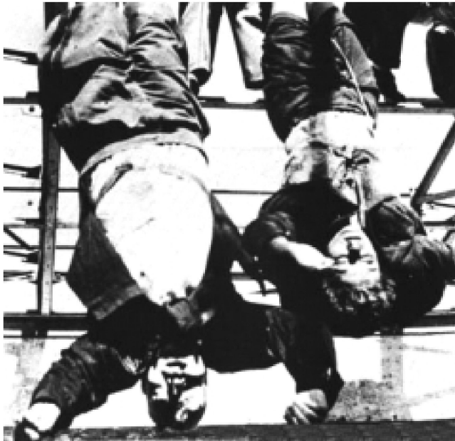
At the end of the war, Benito Mussolini was trying to cut a deal and blackmail Winston Churchill, who had previously been his controller. The British caught him and his mistress, Carla Petacci, and hung them upside-down.

vate financier interests, which, together with the Anglo-Dutch interests, became essentially a world empire. And what people think of as economics today, is largely a product of this system.