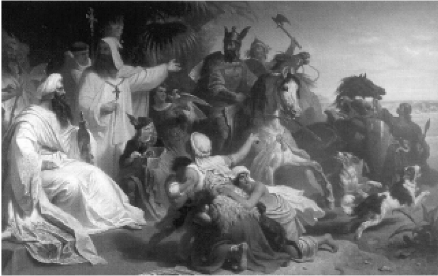
To better understand the historic relationship between Islamic and Christian rulers, look at some contrasts: the murderous Crusaders on the one side; and Haroun al-Rashid's alliance with Charlemagne on the other. Here is an 1864 painting by Julius Köckert, with Haroun al-Rashid on the left in white robe, Charlemagne on horseback.

some rather disgusting, horrible things. On the Christian side, you have these people partying around now, because the Last Days are here, Jesus's Second Coming is imminent, and they're pushing the Administration to launch so they can hurry up and get Armageddon under way [LaRouche laughs], and see this world reduced to a burned-out cinder! I mean, both sides are insane!