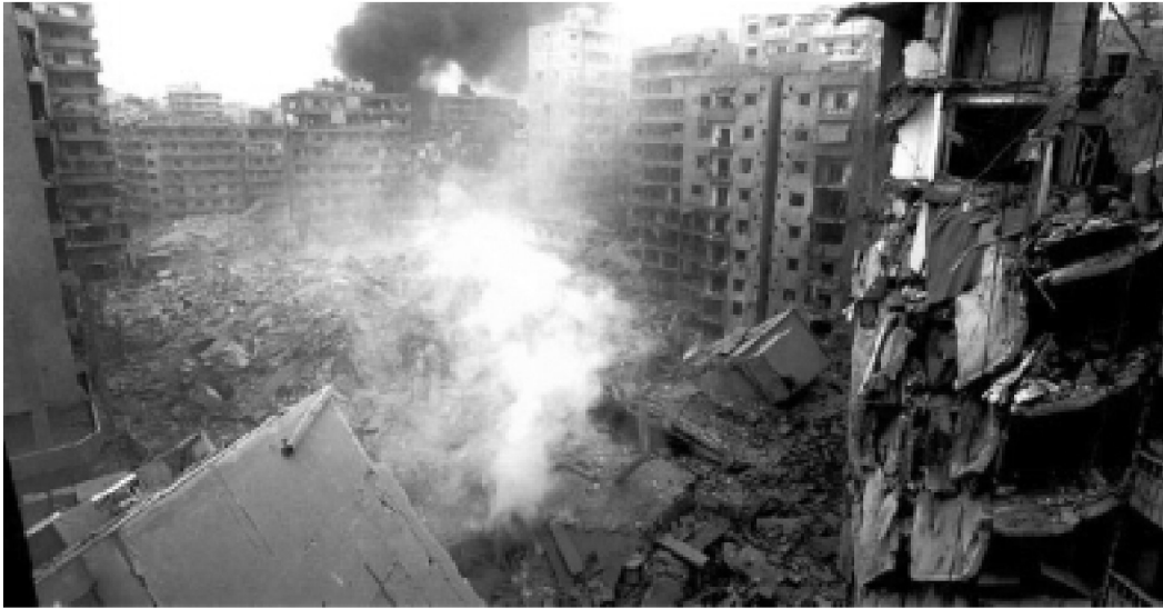
Embassy of Lebanon

With its relentless bombing of Lebanon, LaRouche said, "Israel has walked into something which is a piece of stupidity and a piece of willful suicide." Here, Beirut in July.