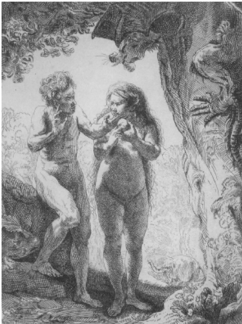
The distinction of human from animal life, writes LaRouche, “is the fundamental issue of economy, which separates my own commitment to truth from the prevalent, Liberal, views and practice of political-economy today.” Here, Rembrandt’s “Adam and Eve” (1638). Rembrandt portrays the couple paradoxically, as not yet fully human, not yet enlightened by reason. The viewer is led to ponder the necessary role of culture, in bringing human potential fully to life.

For example: were the human species a member of the category of higher apes, the population of our species could not have ex-