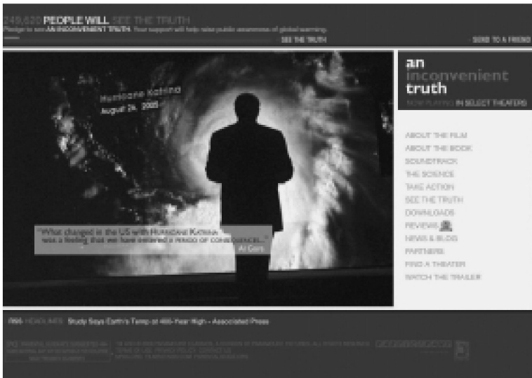
Advertisement for Al Gore's propaganda film on "global warming." LaRouche comments that "although an increasing number of governments, and other circles, have declared their intention to cope with what are called the challenges of depletion and pollution of planetary resources, most of the globalist policies recommended and actually implemented thus far, have been treatments worse, even far worse than the alleged disease."

lenges of depletion and pollution of planetary resources, most of the globalist policies recommended and actually implemented thus far, have been treatments worse, even far worse than the alleged disease. In fact, the systemic implication of the modern Delphic, neo-dionysian cult of "environmentalism," is that such attempted impositions of law place man on the same categorical level as the beasts eaten for food. The present, bestial view of mankind advocated by the current crop of neo-malthusians, must be replaced with a view which is actually in accord with the reality of nature, the reality of the absolute, mental distinction, and qualitative superiority of the human species, the distinction from, and absolutely above all other forms of life.