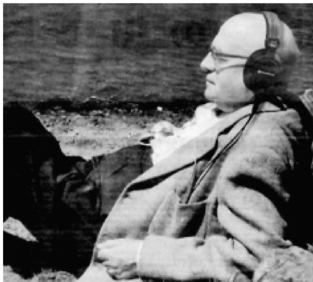
Hofstadter was much impressed with The Authoritarian Personality, a project directed by Theodor Adorno (shown here). LaRouche writes that Hofstadter and Adorno’s German existentialist circles, typify the generation of Liberals “which opened the gates before my eyes, for my clearer view of sundry sorts of Hellish tyrannies which I have witnessed in those times past.”

The Liberal’s faith is, essentially, his fear of lacking the power of suggestion to “win friends and influence people” honestly. He is often stickily gregarious, but never really