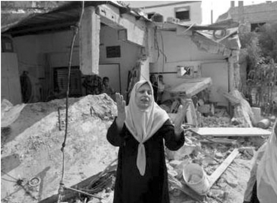
Embassy of Lebanon

LaRouche underlined that the entire population of Lebanon is behind Hezbollah in this war, viewing Israel as the aggressor. "Now, this is asymmetric warfare," he said. "Which means that regular armies, as we see in the case of Iraq, regular armies trying to fight their way, and win that war, as Bush keeps saying, can not do it!"