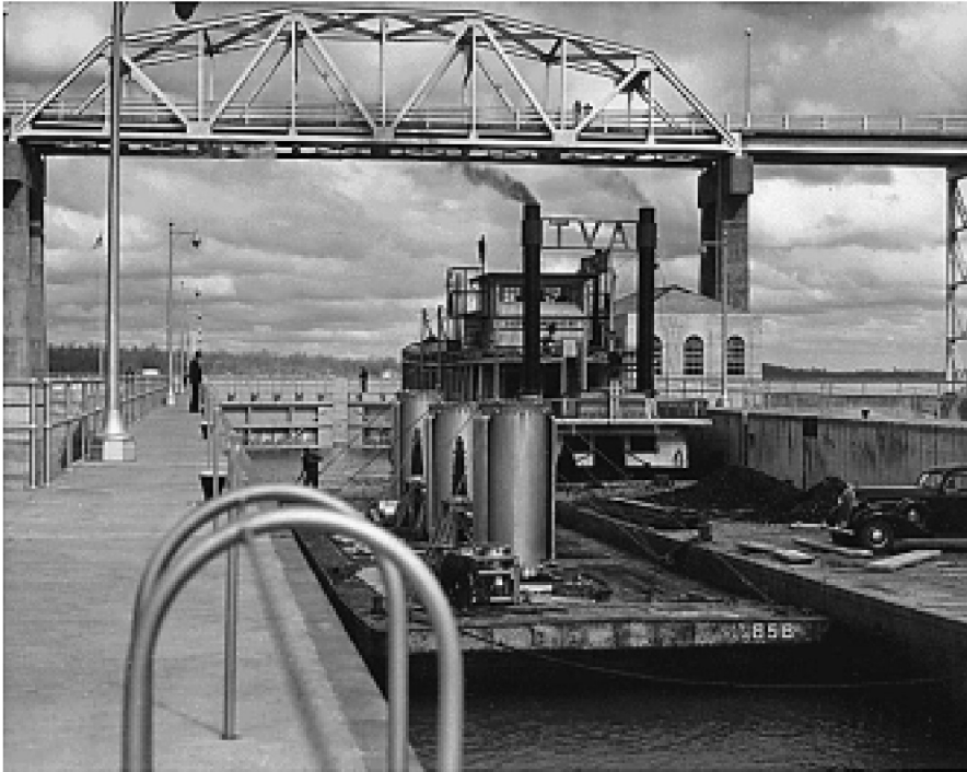
The Wheeler Dam navigation lock in Tennessee in 1942, constructed by Roosevelt's Tennessee Valley Authority. This was the first of eight dams that the TVA constructed on the Tennessee River. The Federal government provided the credit for these massive infrastructure projects, to get the economy moving again.