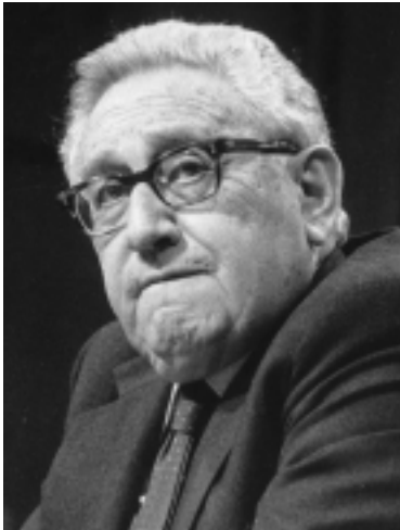
Henry Kissinger