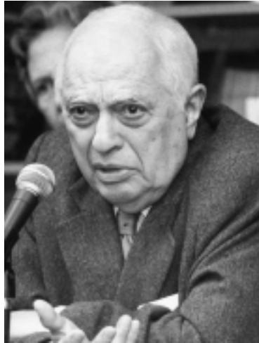
Bernard Lewis