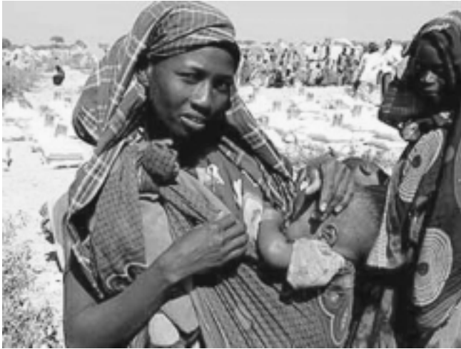
World Food Program