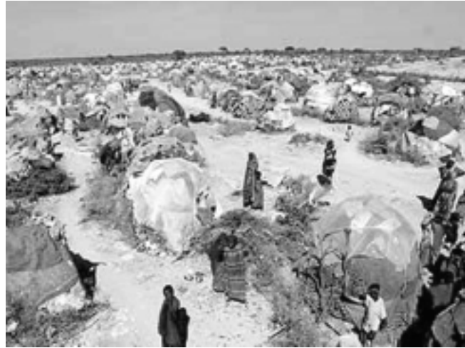
World Food Program

Somalis who have been forced to leave their land, and to flee the violence of local militias, or are now fleeing the U.S.-sanctioned Ethiopian military intervention, end up in camps such as this one. They live in shelters they make from sticks and rags, and become dependent on food aid.