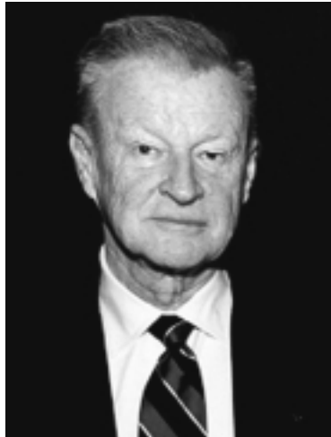
Zbigniew Brzezinski

Bernard Lewis (presently at Princeton University) is a British Intelligence hand who played a key role in designing the Arc of Crisis, originally planned to extend from Afghanistan and Pakistan, through South West Asia, and ultimately, he proclaimed, extend to Africa. Kissinger and Brzezinski were active proponents of this destabilization process, both as U.S. officials, and afterwards. Now Dick Cheney kicked the African end of this Arc of Crisis into gear, by aiding Ethiopia in its military intervention into Somalia, and then getting the U.S. military to indirectly intervene as well.