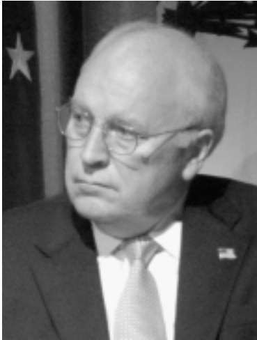
Dick Cheney