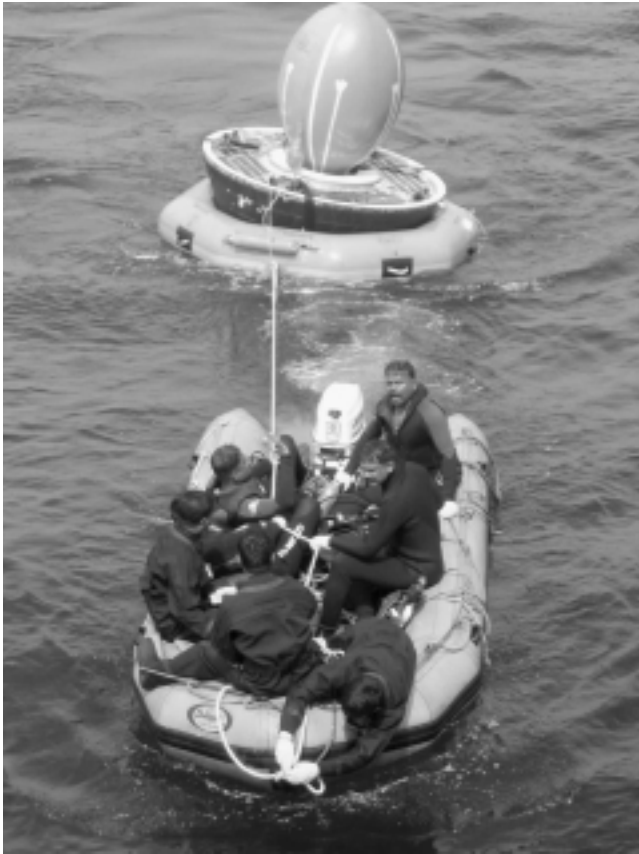
Indian Space Research Organization

After a 21-day mission orbiting the Earth, SRE-1 fired its onboard thrusters and splashed down in the Bay of Bengal. A flotation ring has been put into place around the capsule, as it is being brought back to shore.