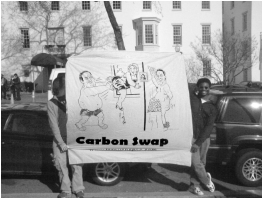
The LaRouche Youth greeted Gore with humor when he went to perform in Washington, D.C. on March 21.