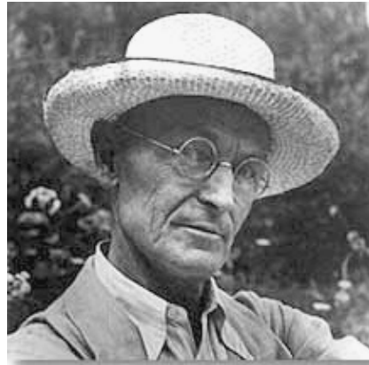
Hermann Hesse, taking directly from the nihilism of Nietzsche, wrote the book on the anti-Christian ideological shift the Conservative Revolution wishes to achieve.