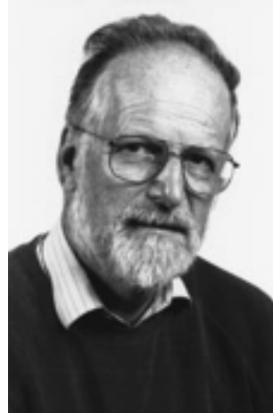
Weapons-expert Dr. David Kelly had, in all probability, questioned the infamous Blair Dossier of September 2002, which was decisive for the manufacture of lies which led to the Iraq War. At the high point of the Blair-driven media witch-hunt against Kelly, he was found dead in July 2003. It was called a "suicide."

ber 2002, in discussion with BBC correspondent Andrew Gilligan, the dossier which was decisive for the manufacture of the lies which led to the Iraq War. At the high point of the Blair-driven media witch-hunt against Kelly, he was found dead in July 2003, under unclear circumstances. The official, but broadly doubted explanation is that it was "suicide."