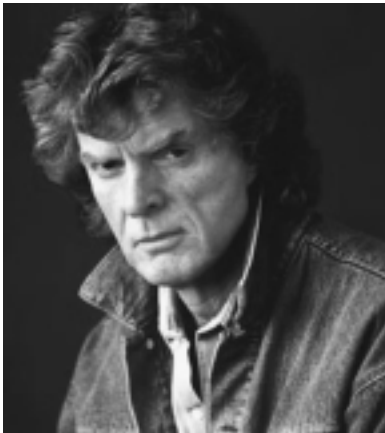
“After Don Imus, Al Gore should be next.”