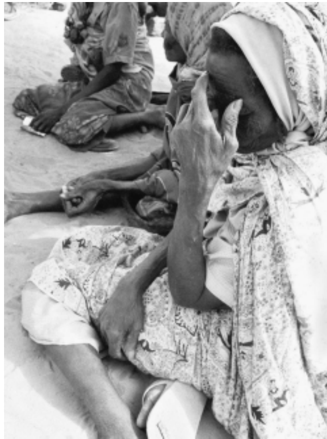
Lord Kitchener’s invasion of Sudan in 1898 has remained “an included, featured pivot of British imperial geopolitics, worldwide, to the present-day in Darfur.” Here, a woman displaced by the war in Northern Darfur.

Among relevant circles in Boston 5 and Manhattan, most notably, the leading intention at that time, and since, has been to assimilate Boston and Manhattan into London, as early as this might be pulled off. The assassination of President John F. Kennedy, and the ruinous effects of the U.S. plunge into the trap of a Indo-China war led, thus, to the near-triumph of what President Eisenhower denounced as the “military-industrial complex” represented, today, by the intimate alliance of Prime Minister Tony Blair, Al Gore, and the Bush-Cheney Administration.