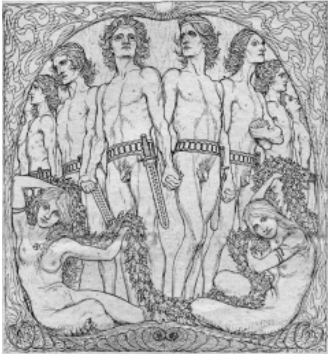
The back-to-nature cults of the early 20th Century, such as depicted in this 1913 drawing of “spiritual German youth,” were a deliberate creation of the oligarchical elite who called themselves the Conservative Revolution. These nihilistic, anti-technology youth eventually fed into the mass fascist movement.