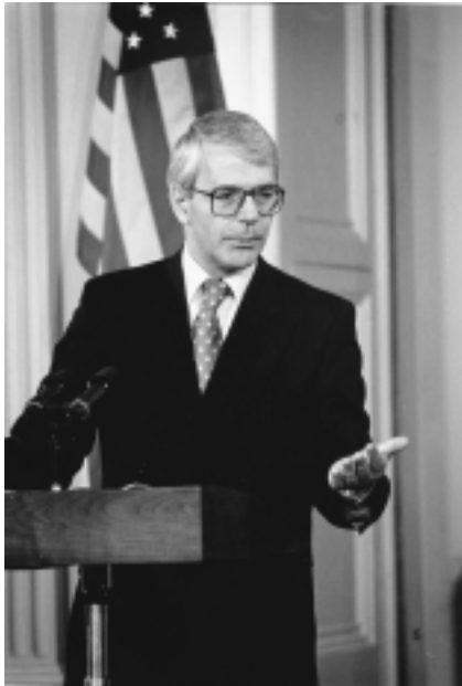
The Hogg ring traces back to the 1990-1995 period of Prime Minister John Major. Lady Hogg had been head of the Policy Unit at 10 Downing Street, designing the schemes for privatization and globalization, and was Major's main advisor at the time of the 1995 creation of the World Trade Organization.