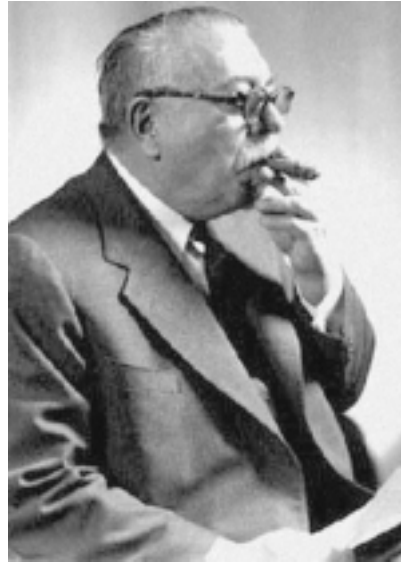
Norbert Wiener’s promotion of “cybernetics” was a conscious attack on the Classical scientific method of Johannes Kepler. Among his collaborators: Gregory Bateson, Margaret Mead, John von Neumann, Kurt Lewin, and Max Horkheimer, the head of the Frankfurt School.

It was from this network that the utopian concept of “artificial intelligence” was posited, as an outgrowth of cybernetic systems research.