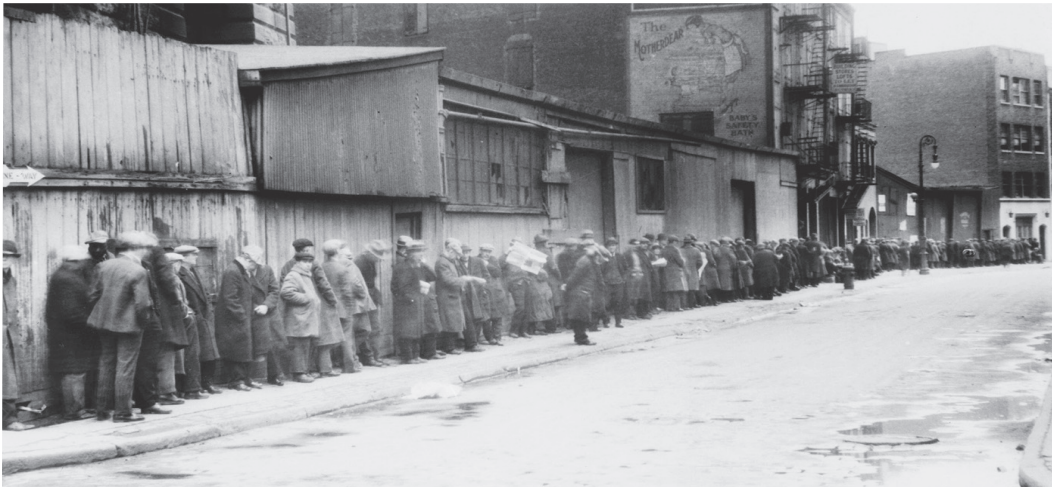
A breadline in New York City. "Never in history have the interests of all the people been so united in a single economic problem," said FDR.