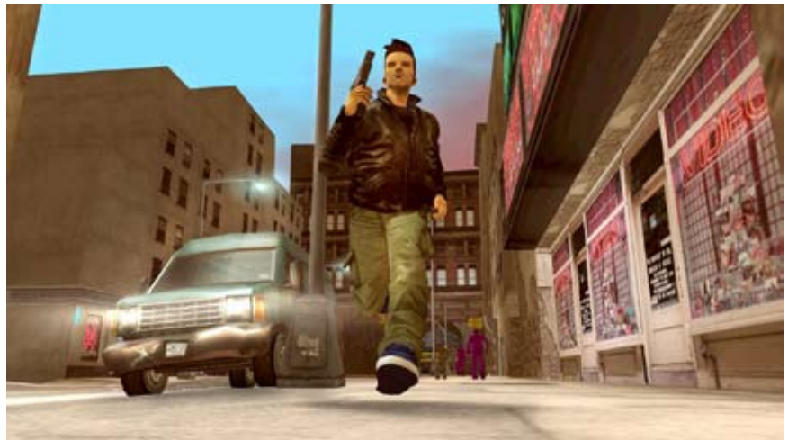
Violent video games, like this one, "Grand Theft Auto," were developed by the military to create soulless killers: "What you're seeing in the world today, for example, is the use of killer games, point-and-shoot killer games, which are producing a new terrorist phenomenon, of our own children who are becoming fanatics and psychotics in shooting."

So, the United States is the target. We have idiots in the United States who think they're not the target. They think they are powers that are going on to victory. The United States is not going to have any world victory coming out of this operation it's pulling now—it will not happen. It's foolishness. We're destroying ourselves. The idea that we're healthy, we're gaining, we're a power: We are destroying ev-