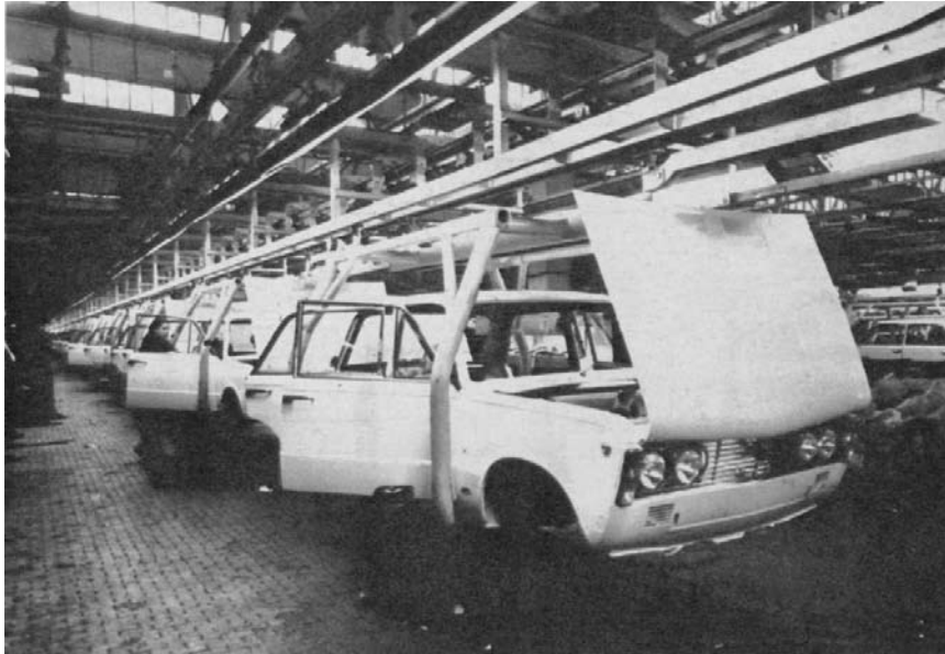
“There is tremendous pressure, especially from a formation called the hedge funds, to loot industries in every country, in every part of the world.” As in the United States, heavy industry and infrastructure have been decimated throughout Europe, by the predatory locust funds. Shown here, a Fiat assembly plant in Poland, circa 1974.

So, what we face is this: We face an attempt under certain international financier interests, who are identical with the idea of globalization, to shut down the industries, and the scientific capabilities, of nations, and to distribute these capabilities around the world, through cheap-labor societies.