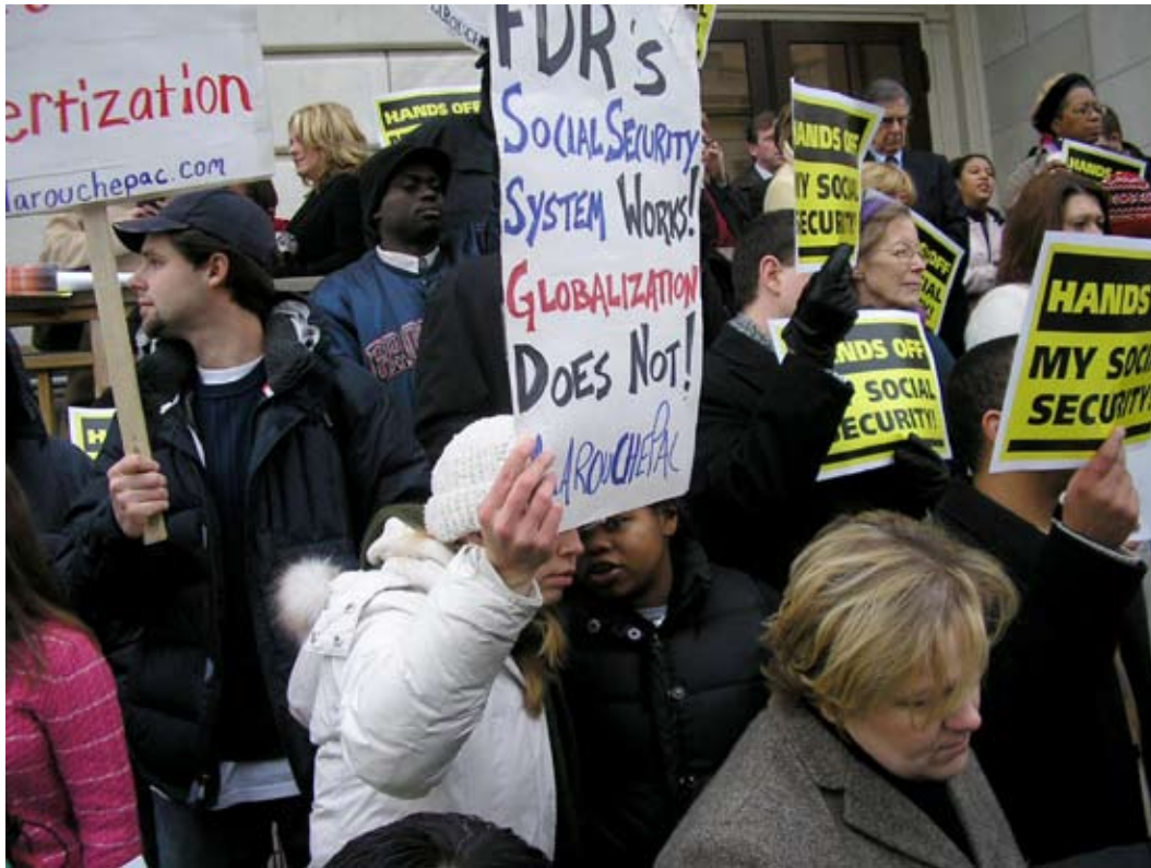
Members of the LaRouche Youth Movement (center) participate in a rally vs. privatization of Social Security in Washington, D.C., February 2005. "There was tremendous pressure put on members of the Democratic Party, who I was collaborating with, on this question of defending Social Security." The Democrats turned tail and ran when LaRouche demanded they fight to save the auto industry.