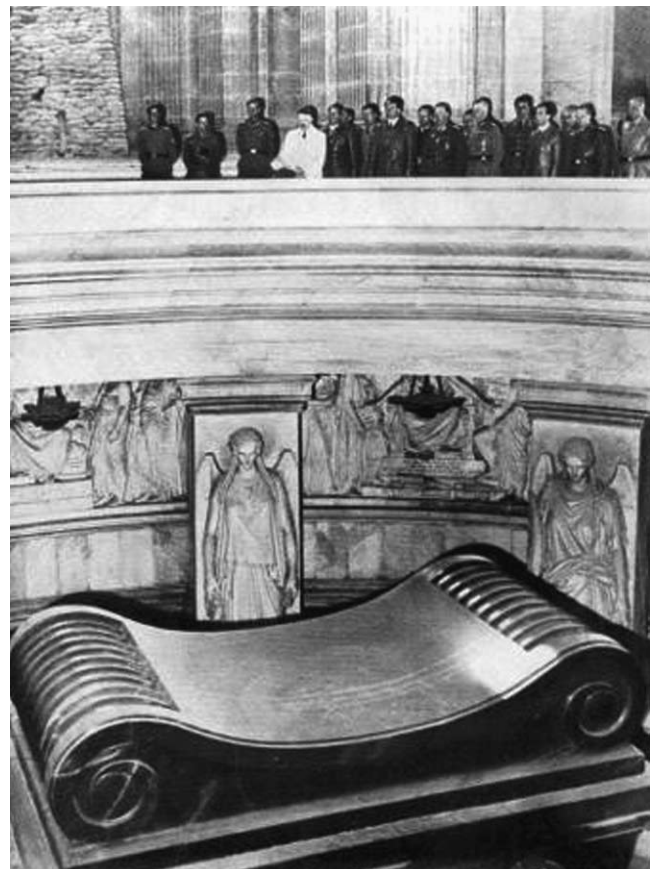
Following the Nazi seizure of Paris in June 1940, Hitler (dressed in white) visited the tomb at Les Invalides of his hero Napoleon. Like Hitler and Napoleon, Dick Cheney ranks among the worst monsters in modern history since the Inquisitor Torquemada.

The evil Zeus represented an oligarchical society, in which Zeus was—as President George W. Bush, Jr. claims for him- self—the bearer of the loutish title of “The Decider.” During a certain time in Germany, a “Decider” was called “ Der Führer .” That convergence of Bush’s and Hitler’s idea of leadership is no exaggeration; similarly, the members of