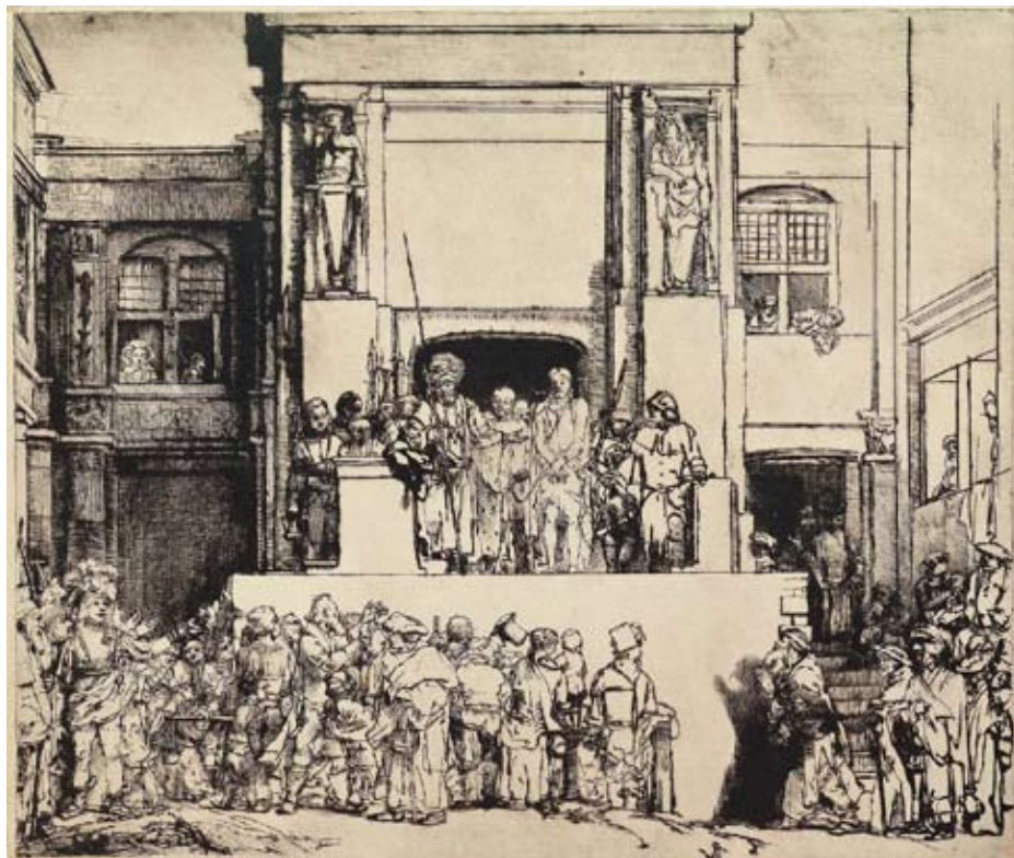
"The Emperor Tiberius' virtual son-in-law, Pontius Pilate, employed his special authority as surrogate in wielding of law for the Emperor himself, to order the crucifixion of Jesus of Nazareth," LaRouche writes. Jesus was feared by the Roman Imperial authorities "as the deadliest of its adversaries from within that region..." In Rembrandt's etching, "Christ Presented to the People" ("Ecce Homo"), Pilate (wearing a turban) is the ultimate Sophist, leaving it up to the mob to decide whether Jesus, or the thief Barabbas should be crucified.

That said, now look back, for comparison, to Aeschylus' portrait of the brutish Olympian Zeus. What is the principle of