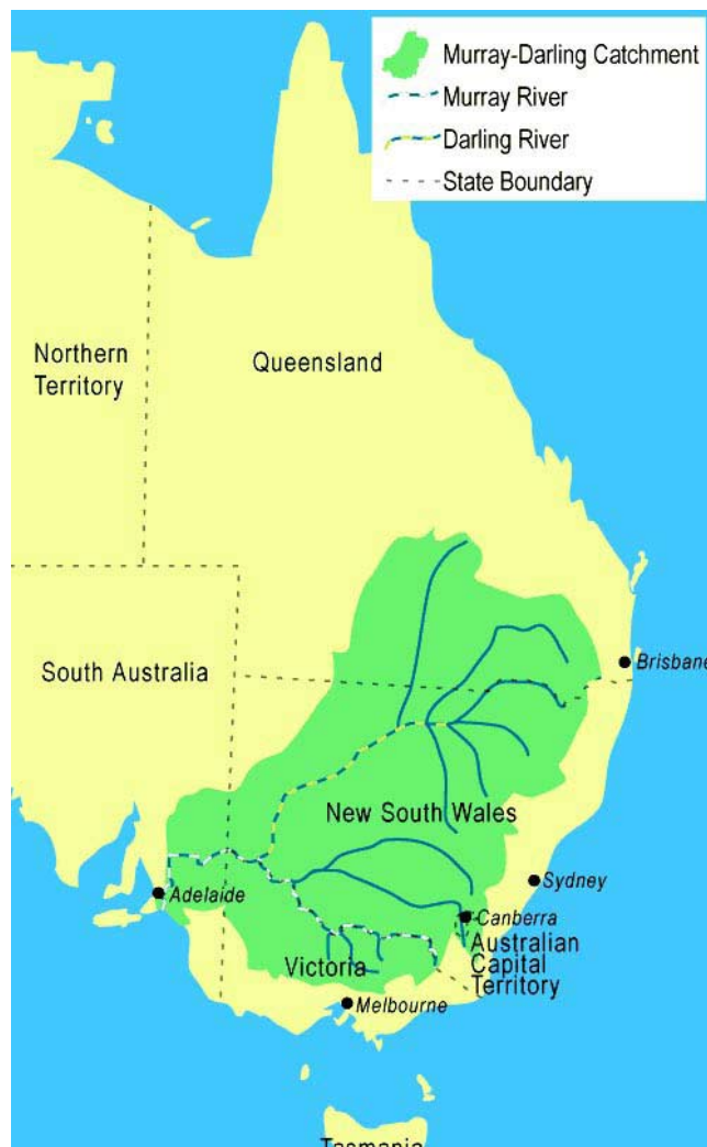
The Murray-Darling Basin in New South Wales, is the breadbasket of Australia; it is targeted for privatization by powerful financial interests, at the expense of Australia’s people, especially its struggling farmers, who are being driven to such desperation that many are committing suicide.

The propaganda line of Howard and his Water Minister, the merchant banker Malcolm Turnbull, is that there will be “price signals” from increased water prices, to tell the “marketplace” to spur on private investment in improvements in water infrastructure, much of which is over 50 years old. But in reality, under the guise of “overallocation” and similar environmentalist buzzwords, farmers will be largely stripped of the 70% of the Basin’s water they now use; they will be bankrupt-