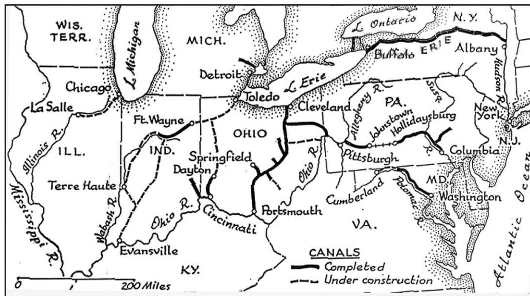
Canals in the 1840s. The Erie Canal linked New York and the eastern seaboard to Ohio and other western states, without going through British-controlled territory. Subsequently, canal networks were built in Ohio, connecting Lake Erie to the Ohio River, providing the basis for industrializing what was then the western part of the United States, and connecting the eastern seaboard to the Mississippi River.

Today, one might think that the building of the Erie Canal should have been obvious; actually, the undertaking was as challenging as the idea of putting a man on the Moon was in the 1960s. For example, President Jefferson, in 1810, when approached by a delegation of New York legislators asking