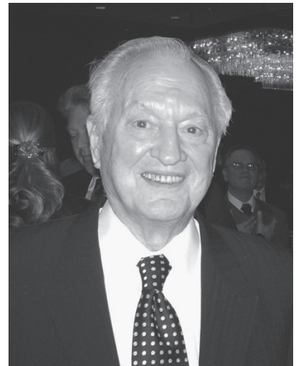
Former Alaska Gov. Walter J. Hickel, Oct. 17, 2007 at the Arctic Energy Summit Technology Conference Awards Banquet, Anchorage, Alaska.

In conjunction with the technologies themselves, attention was given to the effect on the prospects for improvement of life for native peoples and all residents of the vast Russian High North and eastern regions. Representatives from Chukotka (counterpart to Alaska), and from the farther westward