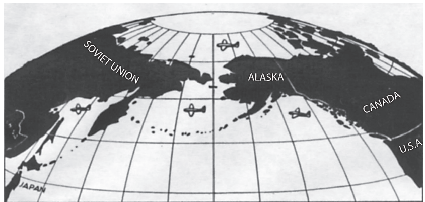
Reproduced from Our Job in the Pacific (1944), by Henry A. Wallace, published by the American Council, Institute of Pacific Relations. Wallace, then Vice President, wrote this after his trip through Canada, Alaska, Russia, and China in the Spring of 1944. The original caption: “Polar air routes and Arctic economic development may make the North Pacific a great post-war communications highway between America, Russia and the Far East.”