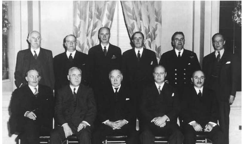
Lord Beaverbrook (Max Aitken) and the British Supply Council in the U.S.A., 1942. Lord Beaverbrook is seated front row center.

Sure. Let's look farther, to Murdoch's latest, and proudest infection: his disease that is infecting our generation.