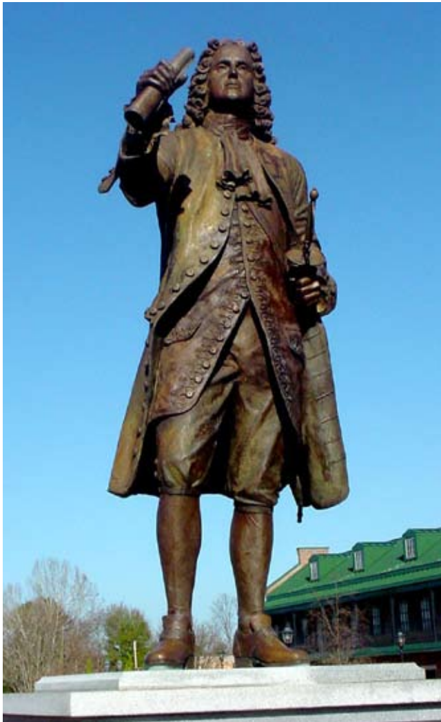
James Edward Oglethorpe, founder of the colony of Georgia, succeeded in banning slavery in the colony, by outfoxing the British imperial oligarchs, who were intent on crushing the infant American Republic in the cradle. Here, Oglethorpe's statue, in Augusta, Ga.

as a mere footnote in history. The story of Georgia is important, not in and of itself, but in its contribution to the understanding of what the New World—America—was!