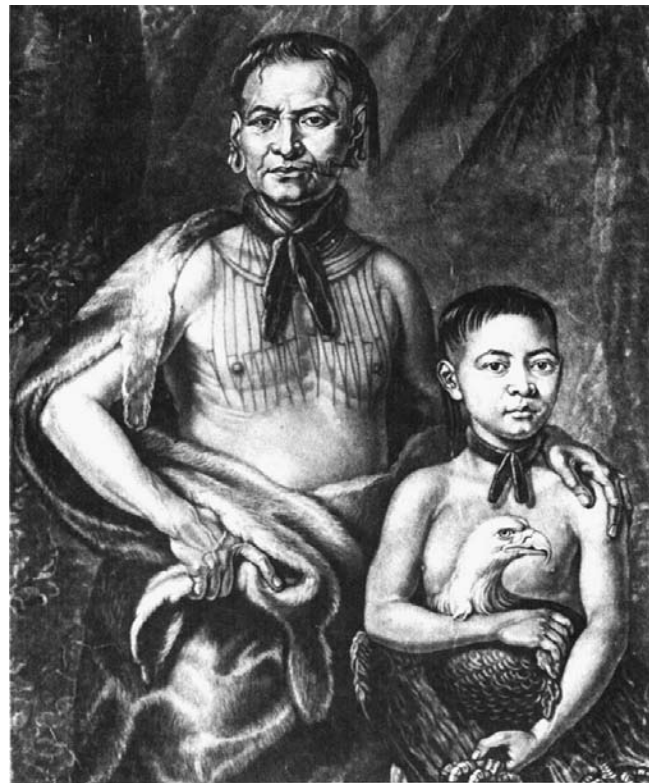
Oglethorpe befriended the Yamacraw leader Tomochichi (shown here with his nephew Toonahowi in an 18th-Century engraving), who presented him a gift of a Bison skin, with an Eagle painted on the inside. The Bison signified strength, Tomochichi explained, and the Eagle, swiftness; but, the Bison skin could provide protection, and the Eagle feathers were soft; and signified love. Thus, the same strength which the English used to crush the Native Americans, could also be used to love and protect them.

But, Oglethorpe also found that operations had been run, to turn Native Americans against him. In May, he wrote: