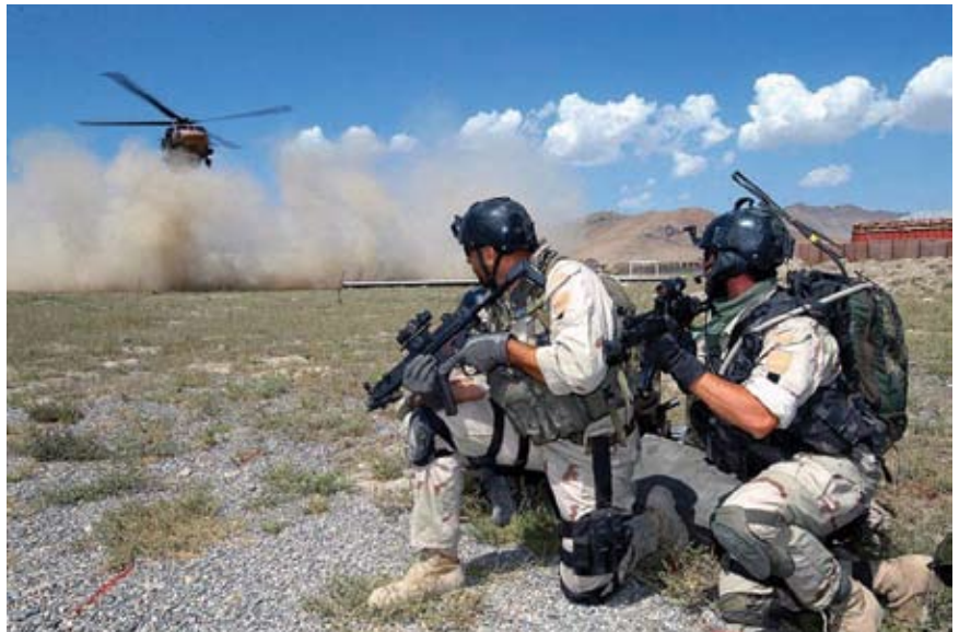
NATO troops in Afghanistan. Under the European Union's proposed Lisbon Treaty, all EU member nations could be forced to participate in EU/NATO military deployments, in the name of "solidarity"—even if their national constitutions forbid it.

Blair promotes this one-world nightmare as a "post-Westphalian world," a reference to the Treaty of Westphalia of 1648, which ended the Thirty Years War, by establishing the principle of "the benefit of the other," and an acceptance of the idea of a system of sovereign nation-states. Blair, and others, wish to see the era of the nation-state come to a bloody end, starting with the total destruction of the United States from within. Indeed, Blair is peddling these ideas as part of his campaign to be the first president of the European fascist super-state, which would come into being early in 2009, if the European Union's