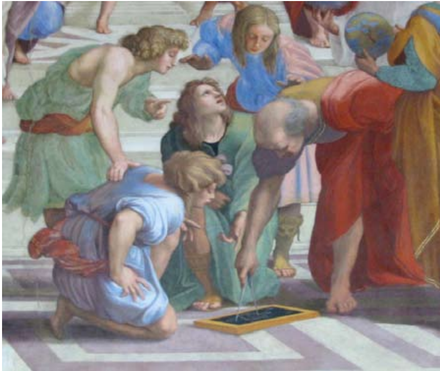
A detail from Raphael's "School of Athens" shows Archimedes teaching geometry. The LYM's Basement Team happily notes that they were "blown away" by the fruitfulness of their collaboration as a group, "working together for the progress of humanity."