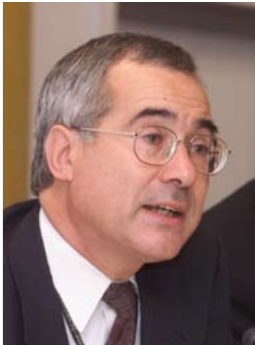
Council of the EU