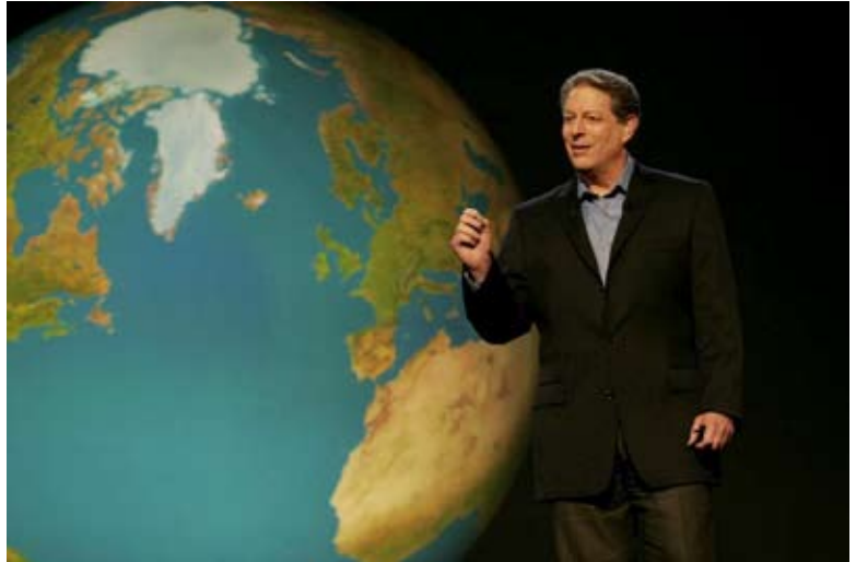
In his super-hyped docu-fraud, “An Inconvenient Truth,” Al Gore asserts that the worldwide increase in malaria is caused by Global Warming. In fact, Lawson states, “malaria has very little to do with temperature.... After all, malaria was endemic in Europe during the little Ice Age!”