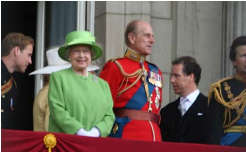
Queen Elizabeth II, and her royal consort Prince Philip, head of the genocidal World Wide Fund for Nature (WWF), with some of their offspring, produced by generations of inbreeding. As the oligarchs like to say: "Breeding will tell."

Prince Bernhard and Prince Philip. Among the WWF's financial sponsors are the world's leading mining, oil, chemical, food, and banking corporations.