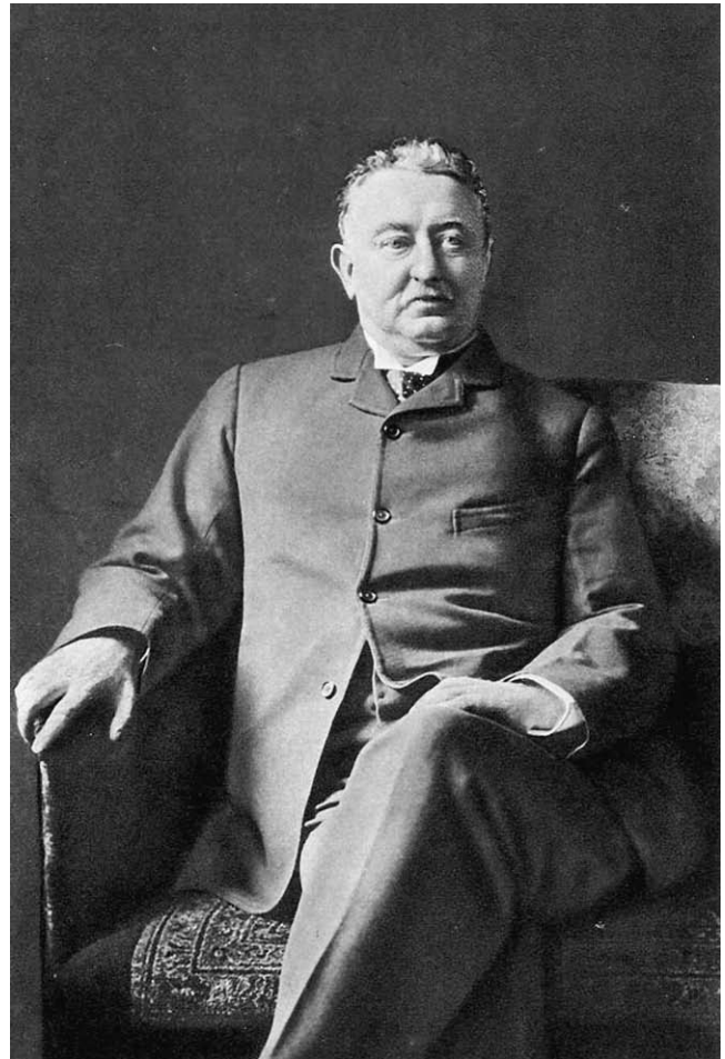
British imperialist Cecil Rhodes, founder of the British Round Table, set out to establish institutions which would ensure that his white supremacist policies would outlive him.

Patriotism, in the tradition of Abraham Lincoln and