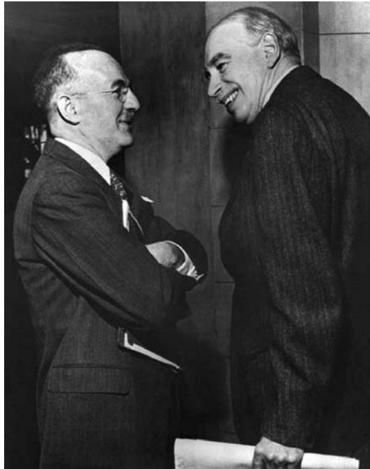
In the preface to the 1937 German-language edition of his General Theory, British economist John Maynard Keynes (right) noted that his economic policies were "much better adapted to the conditions of a totalitarian state." Keynes is pictured here with Harry Dexter White at the Bretton Woods Conference, 1944.

This is the method by which the British Empire hopes to rule the post-crash world. Globalization is just a fancy new name for colonization, with the added ele-