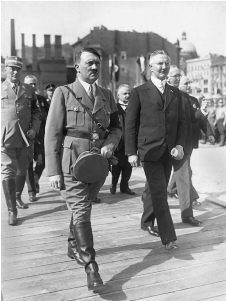
Hjalmar Schacht was installed, by the Bank of England, as currency commissioner in November 1923, at the height of the Weimar hyperinflation, for the purpose of imposing austerity upon the German people; this austerity helped create the conditions which made the rise of the Nazis possible. He is shown here later, with Hitler, when he held the post of Economics Minister.

how the money would be spent, but found himself reversing course almost immediately, under pressure from the British. Whereas Paulson had wanted to use the TARP to buy bad assets from the banks, the Brits had their own plan to have the government inject capital directly into the banks. To help force their program through, British Prime Minister Gordon Brown visited the White House and met with Paulson. At the same time, the Brits launched an attack on the U.S. stock market, driving down bank stocks in particular. The Bush Administration quickly capitulated. That tactic of driving down the U.S. stock market has been used repeatedly since, as a way for the empire to manipulate the United States.