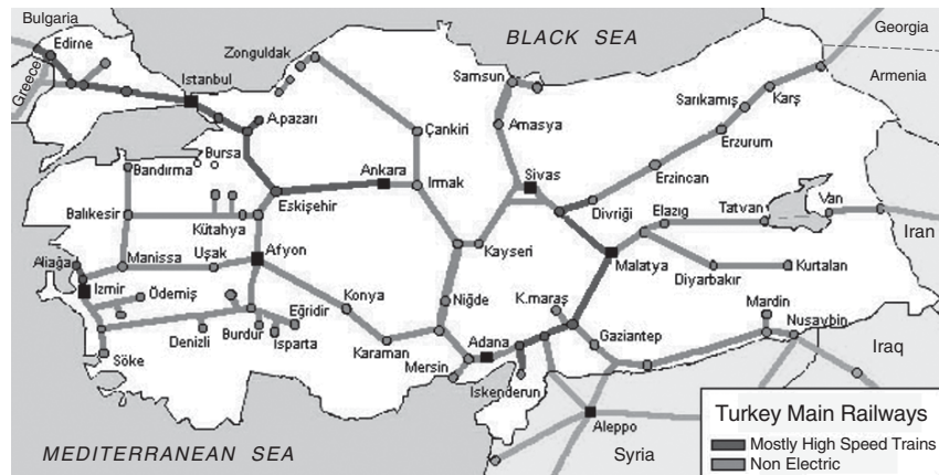
FIGURE 1 Turkey’s Main Railways

As Turkey has moved, so has Iran. On March 4, the Iranian government announced that it had awarded a contract for the electrification of the railroad from Tehran to Mashhad (in Iran’s northeast, see Figure 2 ), a total dis-