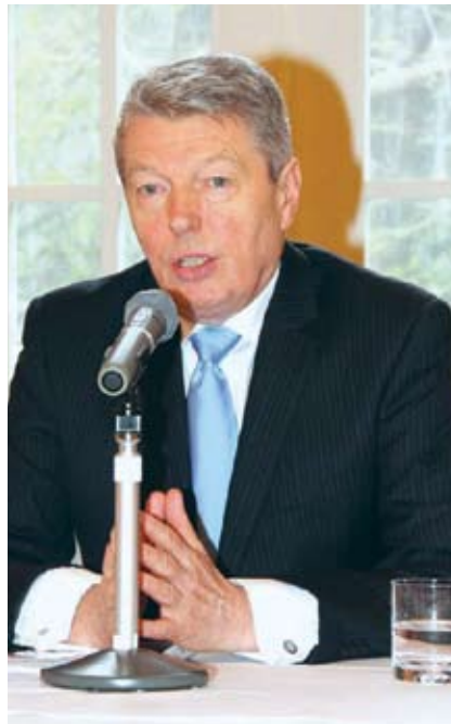
British Health Secretary and Blairite Alan Johnson delivered a message to the annual meeting of the World Health Organization, not to declare the A(H1N1) virus a Level 6 pandemic. In other words: "Drop dead!"

"Dominated by a handful of pharmaceutical multinationals gripping their patents on feedstocks and manufacturing processes, existing production facilities worldwide can only produce, at best, 5 billion flu vaccine doses within one year—if and when they ever