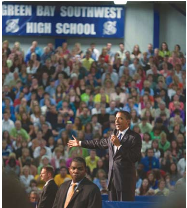
President Obama goes out on the stump to promote his killer cuts in health care, at a town meeting in Green Bay, Wisc., June 11.

MedPAC releases a 300-page report outlining its proposals for cutbacks in Medicare and Medicaid, at an event in Washington, D.C. They are confronted by