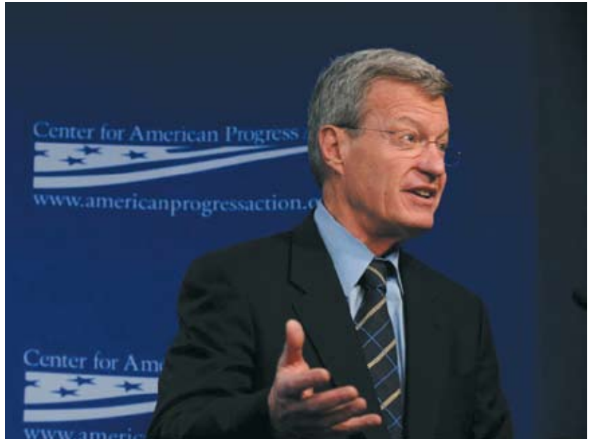
On May 4, Sen. Max Baucus (D-Mont.), Obama’s Senate point man on health-care “reform,” outlines his “fast-track” perspective for ramming through the health-care bill, on a media conference call.

May 20: Baucus holds another closed-door session of his Senate Finance Committee on health care.