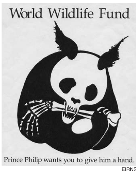
Prince Philip's WWF (now called the World Wide Fund for Nature) is grabbing 30% of Mexico's total territory to set up "green" zones outside Mexican sovereignty.