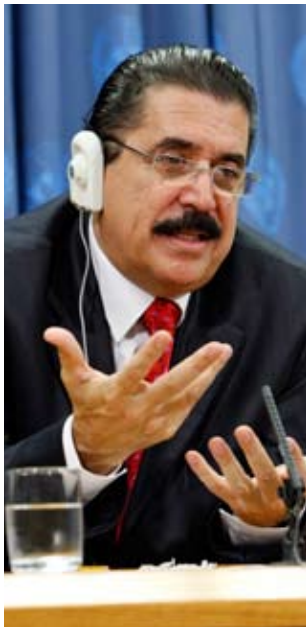
Manuel Zelaya, the deposed President of Honduras, publicly joined Soros's drug legalization movement in October 2008. His attempted coup against the Constitution last month was blocked.

the Soros legalization bandwagon in October 2008, and in June 2009 he moved—with the vociferous backing of Venezuelan President Hugo Chávez's "Bolivarian" apparatus in the region—to try to illegally change the Constitution so as to allow his own reelection. Fortunately, Honduran institutions such as the Supreme Court, the Congress and the Attorney General thwarted the coup, and deposed Zelaya from office instead, shipping him out of the country.