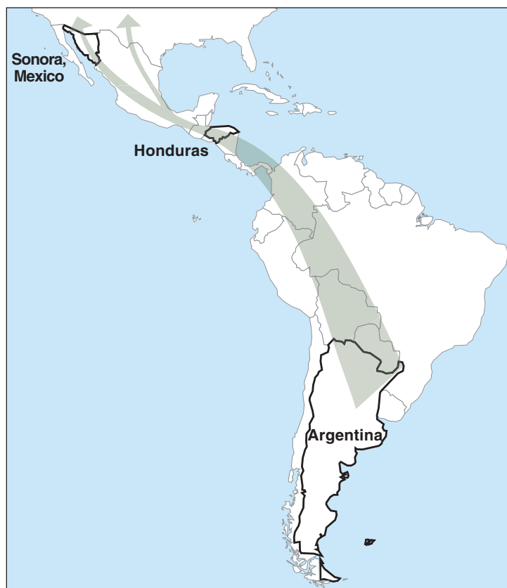
FIGURE 1 Dope, Inc.'s War Against the Americas

escalated his long-standing campaign to bring about the legalization of drugs internationally. One of his targets has been Argentina, where the Supreme Court is expected to rule imminently on the legality of possessing drugs for “personal consumption.”