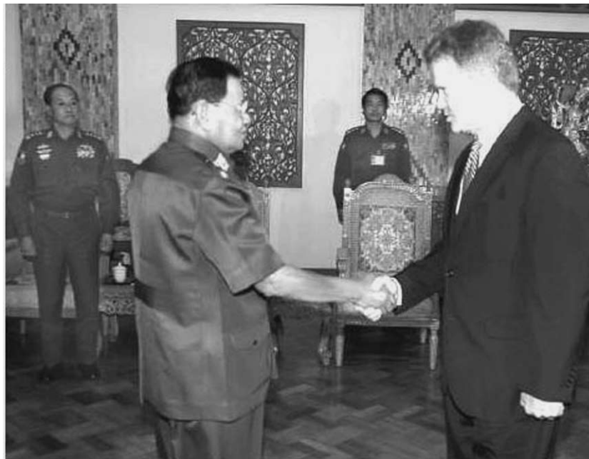
Embassy of the Union of Myanmar

Suu Kyi immediately assumed the leadership of a makeshift democracy movement in Burma, while a fac-