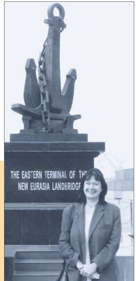
Helga Zepp-LaRouche known as "the Silk Road Lady," has played a major role in organizing worldwide support for the Eurasian Land-Bridge. She is shown here at Lianyungang Port in China, October 1998.