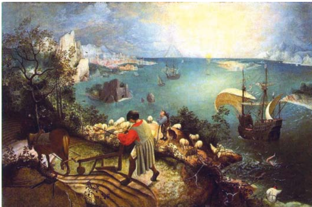
“It is the farmer, not the rooster, who reigns over the hen house. It is the human farmer who reigns over that whose fate mankind willfully determines.” Shown: Peter Bruegel the Elder, “Landscape, with the Fall of Icarus” (1558).

This is no diversion from the scientific subjects referenced in this and similar reports. Mankind is not merely a specimen which happens to have been located on Earth; mankind is the ruling form of influence inherent in the specifically voluntary capabilities represented by the creative powers of the human intellect. It is the farmer, not the rooster, who reigns over the hen house. It is the human farmer who reigns over that whose fate mankind willfully determines. Government is properly given over to the governing principle of human creative scientific practice of societies and of the human and other species which are the subjects of those societies. This means the inclusion of the creative artistic faculties of the greatest Classical poets, painters, sculptors, and musicians, whose ironical spirit informs the competent practice of discovery within the domains of physical science.