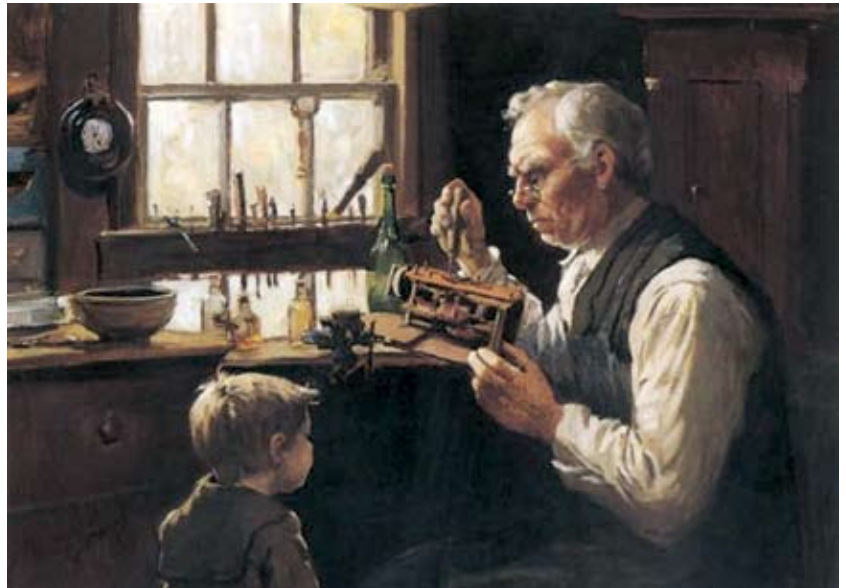
“Truth always lies in the higher order of processes which can be expressed in terms of that which is immediately experienced. ‘The clock has a maker,’ one whose expression is the yearning for a higher order of existence than what we experience in our sense-perceptions of ourselves.” Painting: “The Village Clockmaker,” by Abbott Fuller Graves.

The creative powers of mankind are specific to the sovereign individual personality. These powers can not be conveyed simply by a “connecting medium;” but, such discoveries can, nonetheless, be replicated as echoed within the creative processes of other individuals. Shadows thus appear to admire shadows. This is