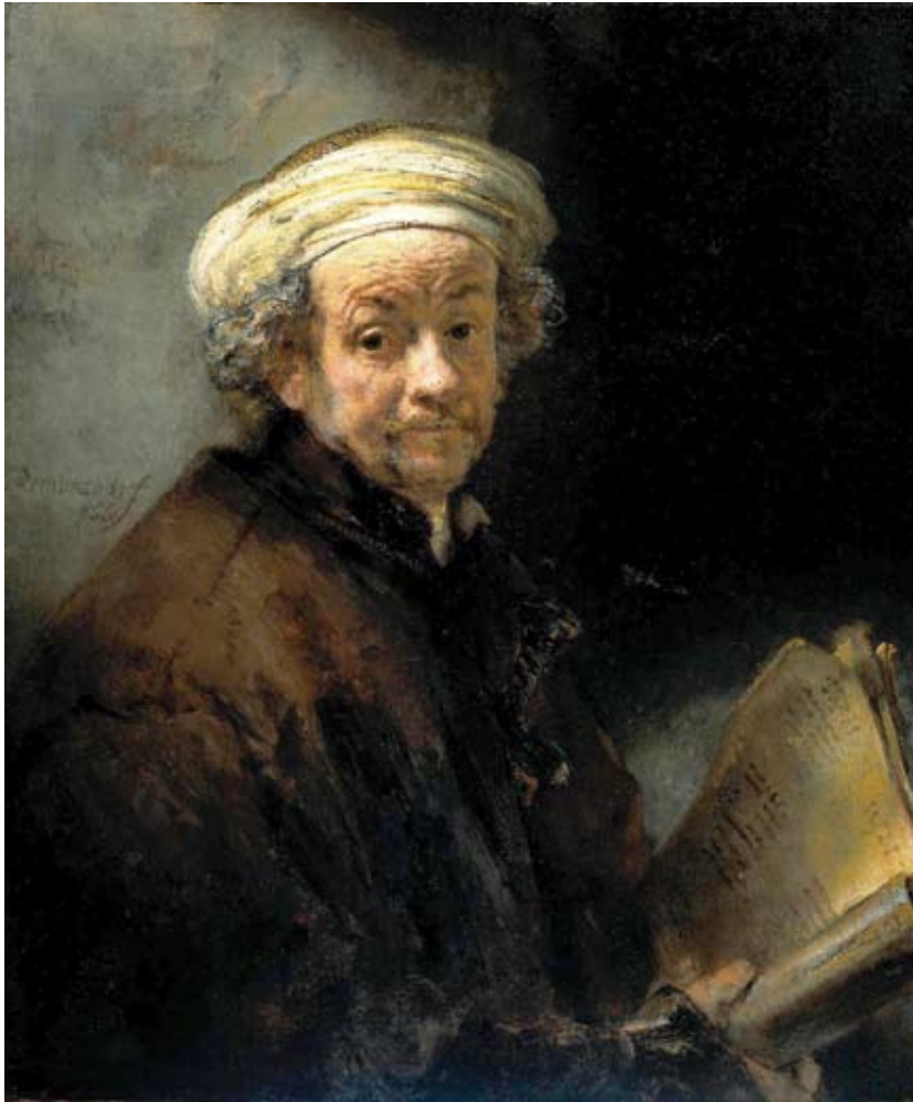
"That quality of immortality which is specific to the human personality, is what is experienced as typified in its expression as true discoveries of universal physical principles, and as the ontological root of scientific creativity in the domain of imagination known as Classical artistic metaphor." Shown: Rembrandt portrays himself as St. Paul (1661).

subsumes our perception of the potential immortality of those creative powers and created true conceptions, which exist only in the human mind, from among all known living species.