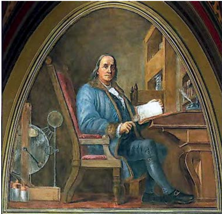
Benjamin Franklin (1707-90)—philosopher, scientist, inventor, printer, musician, economist, and statesman, took up the legacy of the Winthrops and Mathers, in promoting a paper currency, on the model of the Massachusetts Pinetree Shilling.

Presidents such as Andrew Jackson, Theodore Roosevelt, Woodrow Wilson, Calvin Coolidge, and, worst of all, George W. Bush, Jr. and Barack Obama.