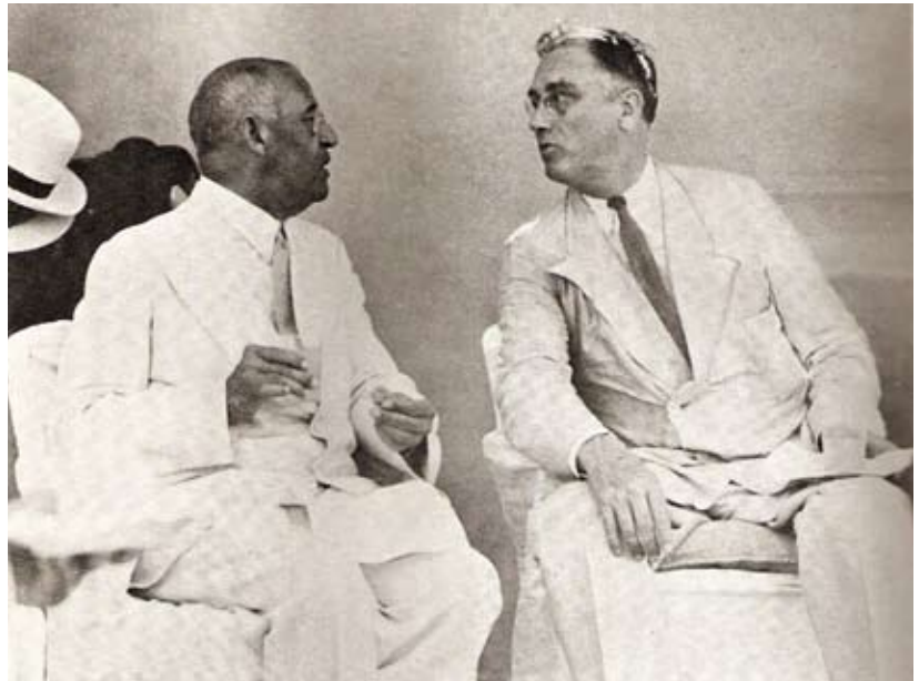
President Franklin Roosevelt (right) meets with Haitian President Sténio Vincent in Cap-Haïtien, 1934. FDR was the first U.S. President to visit Haiti; his Good Neighbor Policy helped to put that nation on the road to prosperity.

This island-nation, first known as Saint-Domingue, has been the victim of the British Empire’s bestial policies virtually from the moment it won its independence on Jan. 1, 1804—the first country in the Americas to do