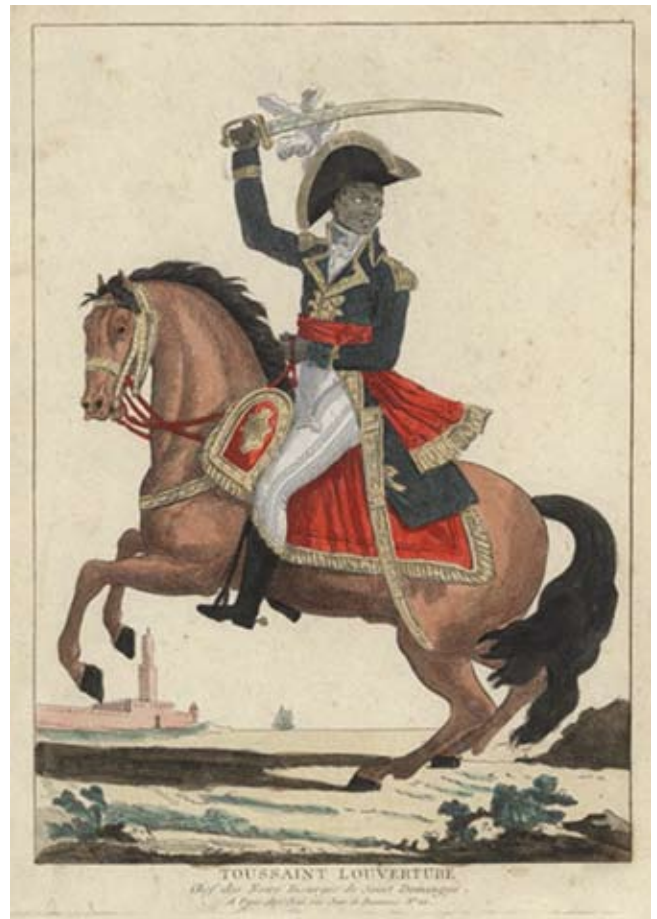
Toussaint L'Ouverture led the only successful slave rebellion in history; his administration succeeded in restoring sugar production to pre-Revolution levels, and built key infrastructure, despite the ravages of a decade of nearly uninterrupted warfare.

It was not until Abraham Lincoln became President