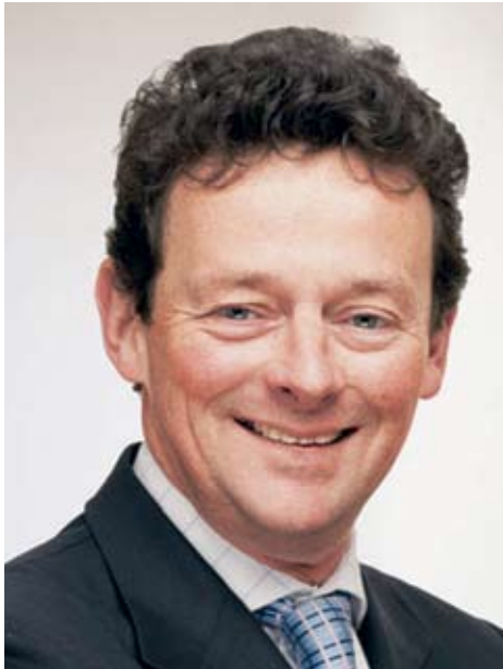
Tony Hayward: There is ample evidence for indictment on charges of criminally negligent homicide.