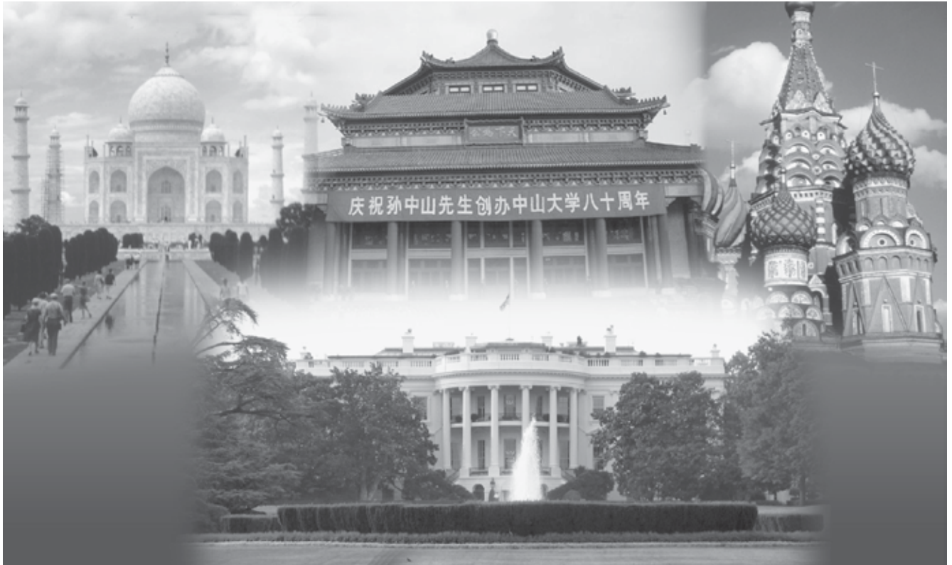
St. Basil's and Taj Mahal, EIRNS/Guggenbuhl Archive; Sun Yat-sen University, sysu.edu.cn/en.

LaRouche's proposal for a Four Power alliance (U.S., China, India, Russia) envisions the relaunching of the world's economy on a global scale, through ending the reign of the British Empire over the sovereign interests of both U.S.A. and of other nations.