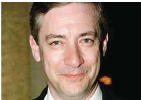
Billionaire Spiro Latsis

In Europe, where the financial crisis has now spread to Spain as expected, and, because of the interdependence of the banks, to Great Britain as well, a similar mass-strike process has developed against the austerity measures, which are seen as deeply unjust, and which naturally affect only the weaker income groups, while the Ackermanns 1 keep their 25% profits. The trade unions in Greece, Spain, Portugal, Italy, and Ireland have called for strikes, and contrary to the tabloid press