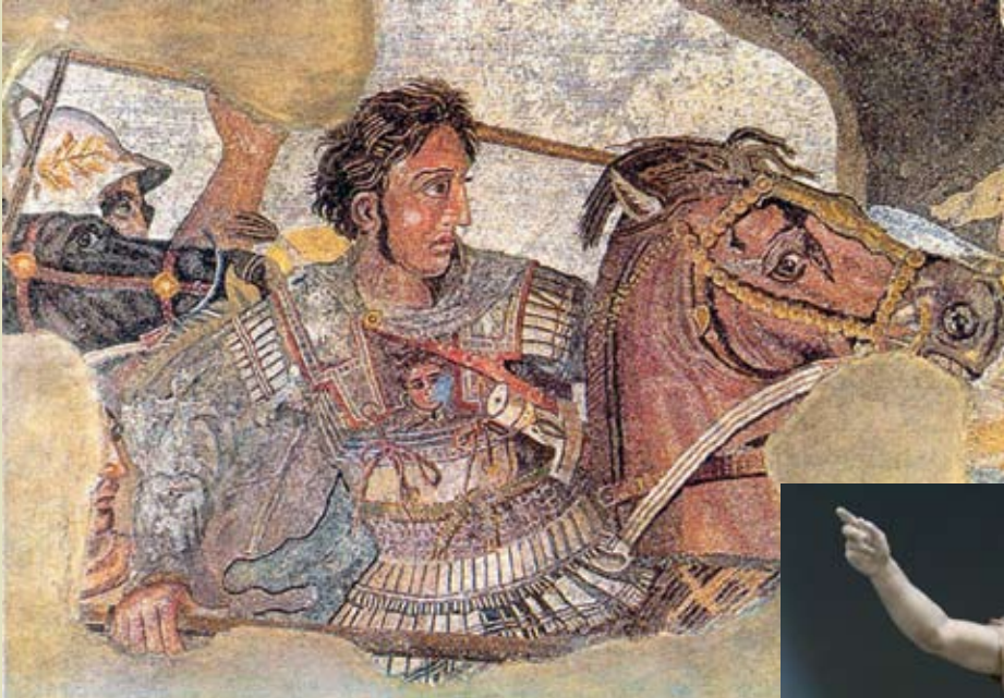
Naples National Archaeological Museum

From the time of the death of Alexander the Great (left), until the agreement reached between the party of Augustus Caesar (below) and the party of the priests of the Cult of Mithra (below left), the three established maritime, religious powers—Rome, Egypt, and Mithra—dominated the Mediterranean, and were later assimilated into a greater power, known as the Roman Empire.