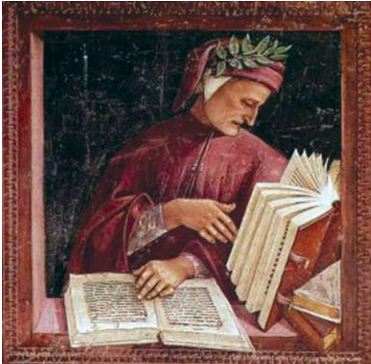
The Florentine statesman and poet Dante Alighieri's great epic poem, the Commedia (ca. 1300), created the first literate, popular language, as the basis for the creation of the modern sovereign nation-state.

who prompted the work of such as, most notably, Gottfried Leibniz and his successors through such celebrated figures as Abraham Kästner, Carl F. Gauss, Lejeune Dirichlet, and Bernhard Riemann.