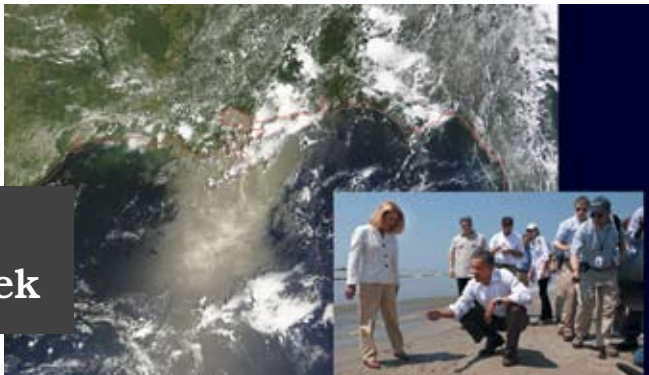
President Obama: Satellite photo of Gulf