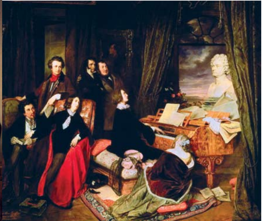
Clara Schumann described Franz Liszt's piano playing as "so abominable that I felt utterly ashamed at having to stay and listen." When Liszt impugned Mendelssohn's character, Schumann stormed out of the room. The painting shows Liszt "Fantasizing at the Piano" in a Paris salon. Inset: Liszt (portrait by Miklos Barabas, 1847).

attack Mendelssohn as not up to Meyerbeer's level. Possibly, Liszt was provoked by a memory of Mendelssohn's habit of parodying Liszt's performances, or possibly it was premeditated, so as to force Schumann's hand. Either way, the insult was not about a comparison to Meyerbeer. Liszt knew that claim could not be taken seriously. However, Meyerbeer and Mendelssohn were distant cousins, both being descended from the famous Rabbi Isserles of Samocz. Liszt was lumping them together, implying to Schumann that Jews are to be compared with Jews, and we non-Jews can resume our own activities. The normally taciturn Schumann rose from the back of the room: "Meyerbeer is a pigmy compared with Mendelssohn . . . an artist who has done great work not only for Leipzig but for the whole world, and you would do better to hold your tongue!" Schumann then stormed out. 63 Liszt first tried to shrug off the confron-