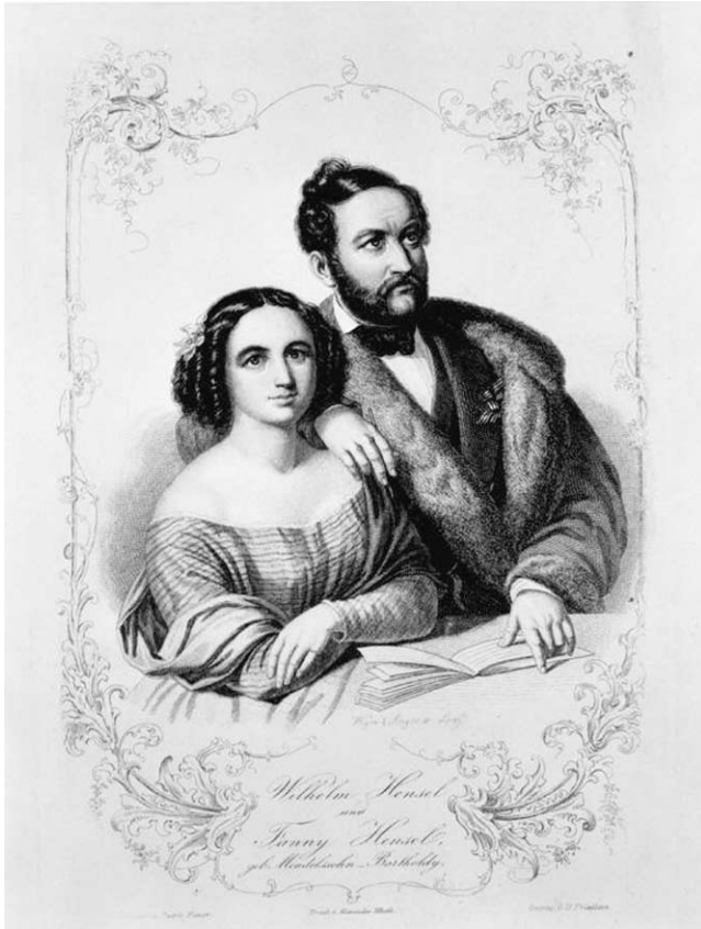
In 1829, Fanny married the painter Wilhelm Hensel, who did many paintings and drawings of the brilliant participants in Rebecca's musikabends.

ried the painter Wilhelm Hensel. They recommenced in 1831, becoming again the center of Berlin's cultural life. Fanny composed for many such events. From afar, Felix still sent his occasional contributions. Rebecca was the soprano for Fanny's lieder. Fanny's husband, Hensel, made paintings of many of the attendees—including Vincent Novello, Eduard and Theresa Devrient, Theodor Körner, Heinrich Heine, Jacob Grimm, Karl August Böckh, Robert and Clara Schumann, Leopold von Ranke, and Dirichlet's close colleague, Carl Jacobi.