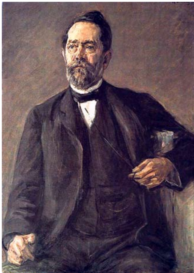
The mathematician Felix Klein described Rebecca's soirées as an "incessant choppy sea of dazzling intellects," which must have distracted Dirichlet from "pure mathematics."