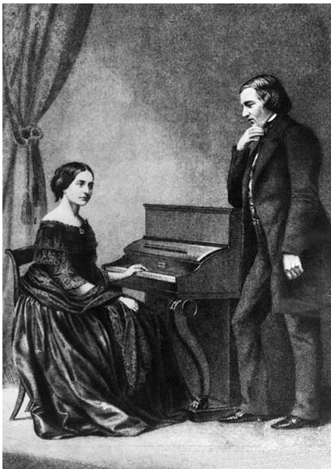
Robert and Clara Schumann joined the cultural renaissance of Mendelssohns, Dirichlets, and Hensels, in 1835. After Robert’s untimely death in 1856, Clara—one of the most celebrated pianists of the 19th Century—continued to write, teach, and play music.

Mendelssohn, one year older than Schumann, moved to Leipzig in 1835, taking the post of the conductor of Leipzig Gewandhaus Orchestra. He opened