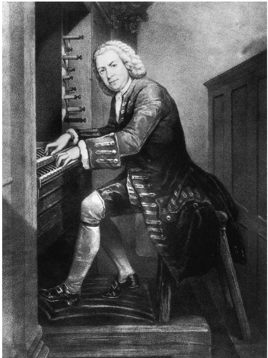
The Mendelssohn family revived the works of the great J.S. Bach (shown here at the organ), notably, the "St. Matthew Passion," which had not been performed for 100 years, and the "Chromatic Fantasy and Fugue," as the core of their music/science renaissance.

the 'Chromatic Fantasy and Fugue,' 'Bach wanted it thus,' 'Bach willed it so,' until one felt oneself in the presence of these great spirits... No one has ever given the 'Chromatic Fantasy' the same breadth and fullness of phrasing and brought out its glorious beauties as Clara Schumann did." 94