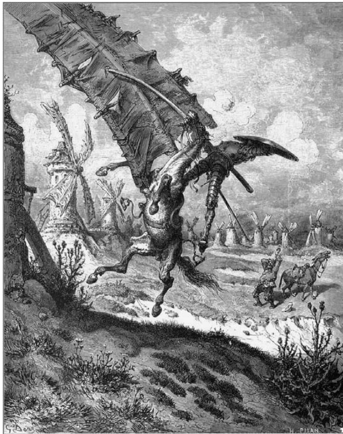
“Get rid of the solar panels! They cost too much, they never pay for themselves! Stop the windmills! Get Don Quixote to work on doing something useful: Stop the windmills!” Gustave Doré’s depiction of Don Quixote, tilting at windmills (1864).

And that is going to be a precedent for a later stage.