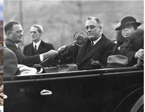
Library of Congress