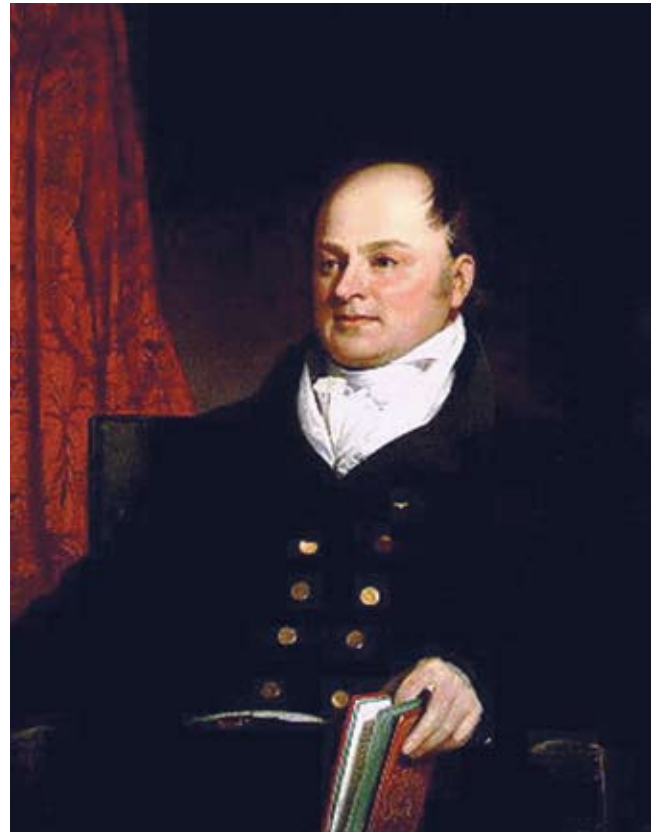
John Quincy Adams, as Secretary of State, as President, and as a Congressman afterward, until 1848—transformed this nation; he was the one who did the most to craft the creation of this nation in its present form.

LaRouche: See, the problem is, what I have to do, at my age, is not only because I have unique competence in this area, but because of the gutlessness of people, also combined with a lack of knowledge. So you have two problems out there, with people who wish to do good: They do not have the guts to do it, and they do not have the position from which to use those guts,