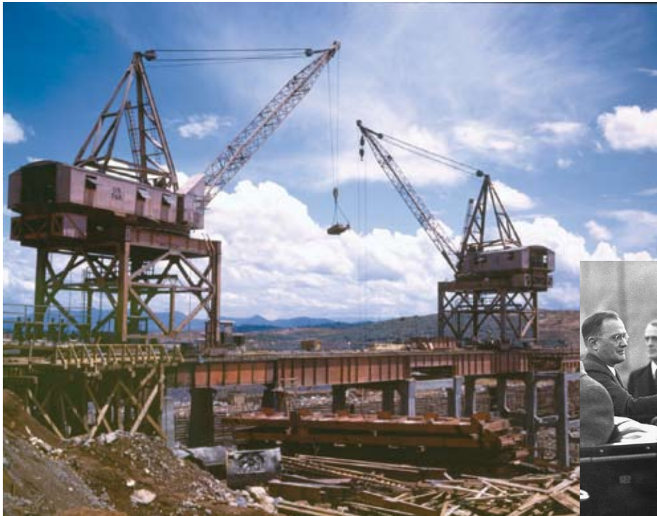
Franklin Roosevelt made a revolution; and one of its the most significant parts was the TVA, in which a virtual swampland was transformed into one of the greatest engineering miracles on this planet. Shown: FDR visits the TVA project at Norris Dam on the Clinch River, Tennessee, Nov. 16, 1934; construction work at the TVA's Douglas Dam, Tennessee, June 1942.