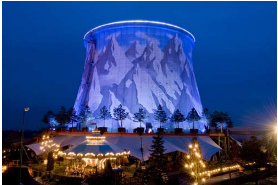
The fast-breeder reactor in Kalkar, Germany, was closed down in 1991 and turned into an amusement park. Its cooling tower is now a "climbing wall." Without reprocessing of nuclear fuel, Germany faces a cold, dark future.

What's going on in Germany? It often seems impossible to persuade the masses. But over longer periods of time, this is easily conceivable. Sometimes it takes a legislative session, sometimes it takes a little longer. Today's youth provide an example: They can no longer imagine that a very large majority of Germans once cheered for Hitler, although all they had to do was look in his book Mein Kampf , to find out what sort of a person he was. So the hope is not unfounded, that we will once again reach a paradigm shift, in terms of science-based, pro-technology environmental awareness. As I said, it