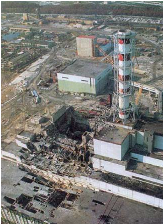
The aftermath of the 1986 Chernobyl accident, showing damage to the main reactor hall and the turbine building. This type of plant was never intended for electric power generation.

about the supposedly uncontrollable risks of permanent disposal!