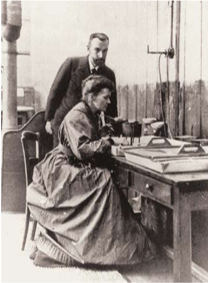
Marie and Pierre Curie in their laboratory. Marie Curie's discovery of radium led to her death from leukemia; she was unaware of the vital importance of the dosage of radiation to which the human body is exposed.

diation. Such findings on dose-response relationships were provided, not only by Marie Curie's leukemia, but also, for example, by accidents in the watch-making industry, where women painted the dials with radium-containing luminescent colors, and tapered the brush tips to a point with their lips. And especially for the huge number of victims of Hiroshima and Nagasaki, the individual radiation exposures and effects on health were recorded precisely and analyzed. Today there is no doubt about the effect of ionized radiation and the dose limits that have to be observed. But anxieties of any kind, when dealing with radioactivity, are completely unfounded, if you know what you're talking about.