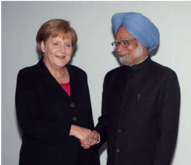
Press Information Bureau of India

German Chancellor Angela Merkel welcomes Indian Prime Minister Dr. Manmohan Singh to Berlin, Dec. 11, 2010. The two discussed future cooperation in India's nuclear power sector.