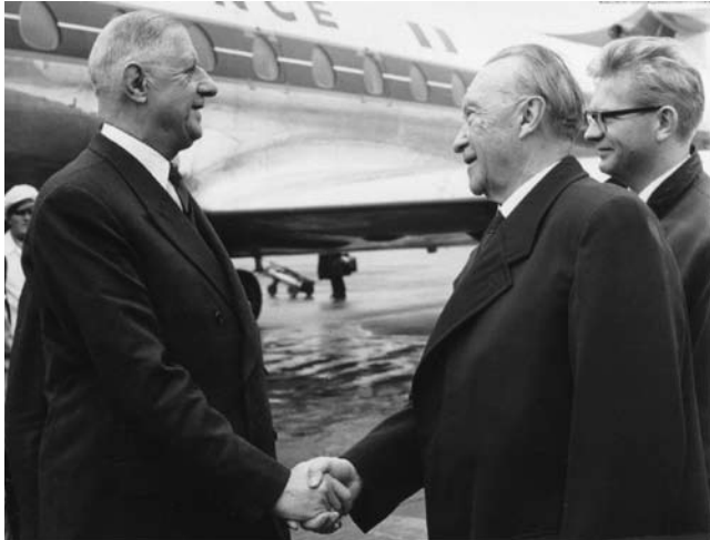
German Chancellor Adenauer (right) welcomes French President de Gaulle to West Germany (1961): agreement on the future of Europe.

part of the project of cooperation in Europe. Adenauer was right.