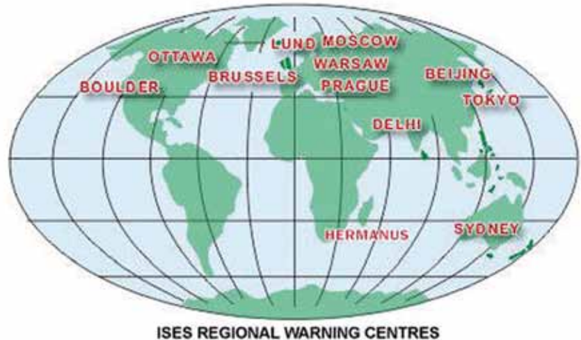
The Hermanus Observatory is one of 12 regional facilities of the International Space Environment Service (ISES)'s Regional Warning Centre Network. The centers are responsible for issuing warnings of geomagnetic storms that can affect radio communications, long-distance pipelines, and electric-power grids on Earth.

Space weather has been around for a long time, of course, but we recently coined the term. It's become a hot topic, because of the effects it's having on technol-