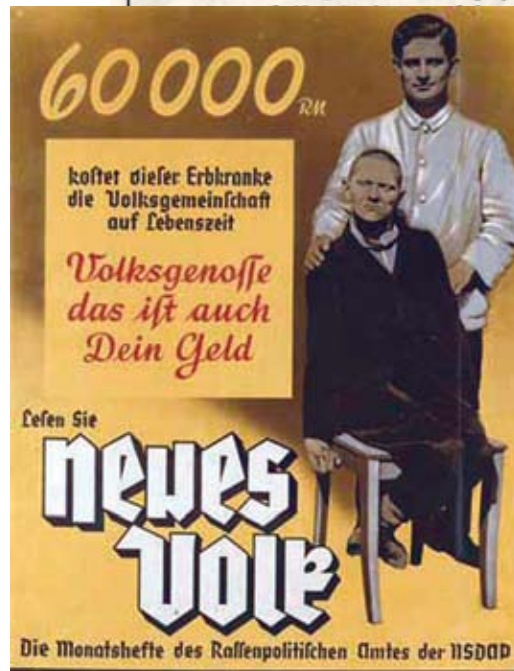
A Nazi euthanasia poster (“This genetically defective person will cost the economy 60,000 Reichsmarks in his lifetime—Comrades, this is also your money”) and New York Times coverage, Oct. 8, 1933, on the Nazi policy and the Germans who opposed it.

The legal question of who may request the application of euthanasia has not been definitely solved. The Ministry merely has proposed that either the patient himself shall “expressly and earnestly” ask it, or “in case the patient no longer is able to express his desire, his nearer relatives, acting from motives that do not contravene morals, so request.”