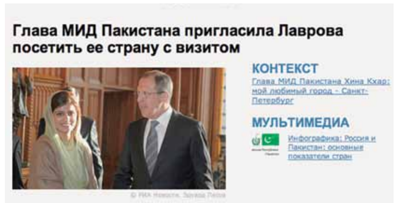
Pakistan's Foreign Minister Khar visited Moscow in February, where she met with Russian Foreign Minister Lavrov (shown here). Moscow is playing a pro-active role in stabilizing Pakistan, and in the process, Afghanistan and Central Asia as well.

No doubt, Washington will wait and watch expectantly. U.S.-Pakistan relations hit a nadir during Zardari's Presidency and Gilani's prime ministership. Washington may choose to claim that the duo was responsible for this downturn, but in reality, it was the