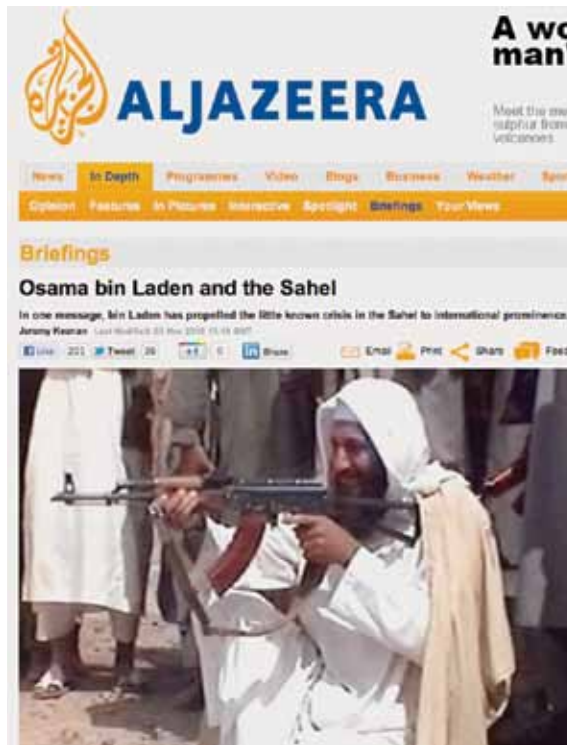
Osama bin Laden, pictured in an Al-Jazeera report on Nov. 3, 2010. Bin Laden, in the mid-1990s, was advised by Saudi intelligence to move from Sudan to Afghanistan and enjoy the protection of the Saudi-assets, the Mujahideen, and later, the Taliban.

Bin Laden, who, in 1994-96, was not known inter-