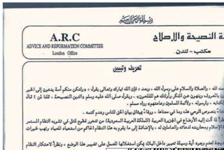
These two anti-Saudi press releases were sent by bin Laden from London in 1994-95, where he established an office for the Advise and Reform Committee (ARC), later, the Committee for the Defense of Legitimate Rights (CDLR). Bin Laden's signature appears above the group's address in London.(below)