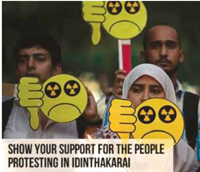
The radical environmentalist group Greenpeace is one of many Western NGOs which are organizing the campaign to close the Koodankulam plant. This photo appears with a Greenpeace-sponsored petition on the Internet.

tingly—was that the protestors were all from countries of the Nuclear Supplier Group (NSG) member-nations.